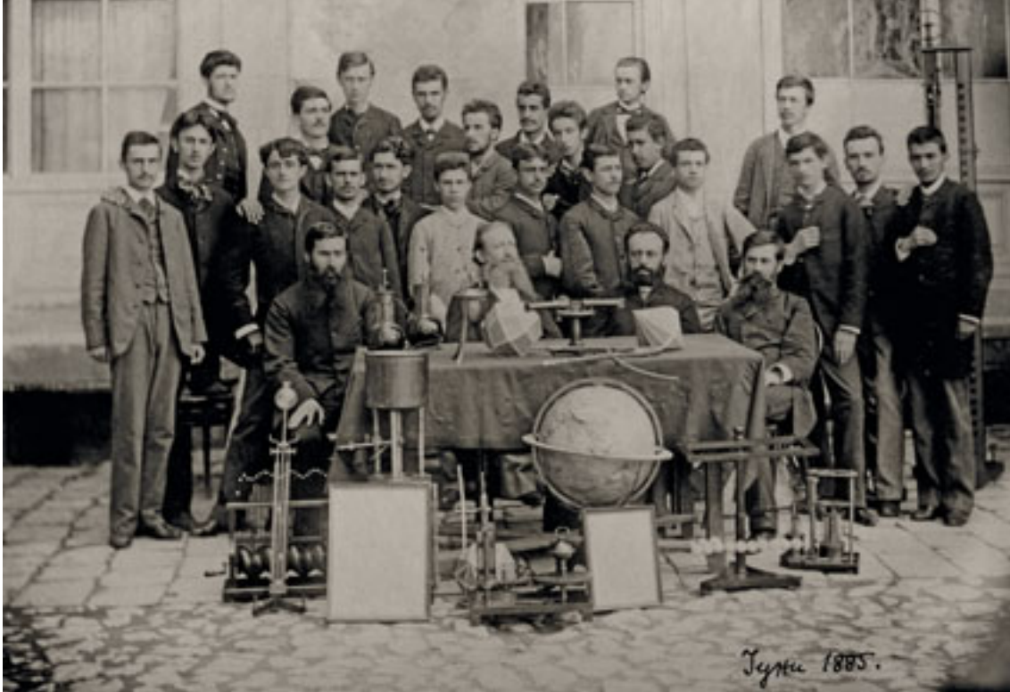
Graduates of First Belgrade Gymnasium, June 1885

“About the schoolmates, some of which are still alive, we do not think to speak individually. Fate had given us various roles in life and we went our separate ways after graduation, meeting up occasionally, getting to know about one another and recalling common old memories. That generation did not give our land a single statesman, but it provided university professors, writers, lawyers, diplomats, doctors and journalists. One fact noted in other generations of high-schoolers became evident in ours, as well: what some of them showed to be capable of as high-schoolers and what they were to contribute to their area of work after graduating and becoming independent was not always in direct correlation. Some of us, whom the teachers had given up on, and even the schoolmates predicted nothing will become of them, went on to become what could not have been expected: great writers, prominent journalists, etc. Conversely, those with all the highest grades did not always turn out to be what they had been expected to become, and they left a much fainter mark than those that had been little counted upon.” 173