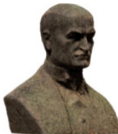
The 3D model of Mihailo Petrović Alas's bust Authors of the 3D model: Vanja Korać and Dragan Aćimović (Mathematical Institute SASA, 2018)

Digital libraries and databases keep and present at one place electronic archiving of all manuscripts, photographs and information related to cultural and scientific legacy and make them more accessible to a wider auditorium. Reflections on Petrović are memorized and continue to live in different media and thanks to the digitization of its legacy we have an easily accessible foundation for information and further research.