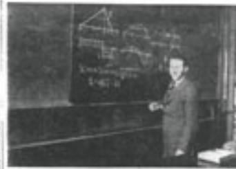
Једна нова велика научна установа на коју треба да имају и свуда јавност

У овом институту ради велики број професора, који су сви врхунски стручњаци у својим областима. Они су сви врхунски стручњаци у својим областима.