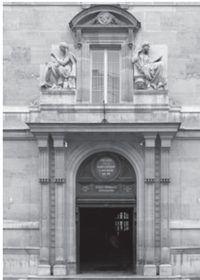
Advanced Pedagogical College, (l'École normale supérieure), Paris