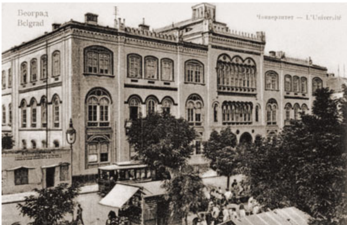
Belgrade Grand School (University of Belgrade) in 1907