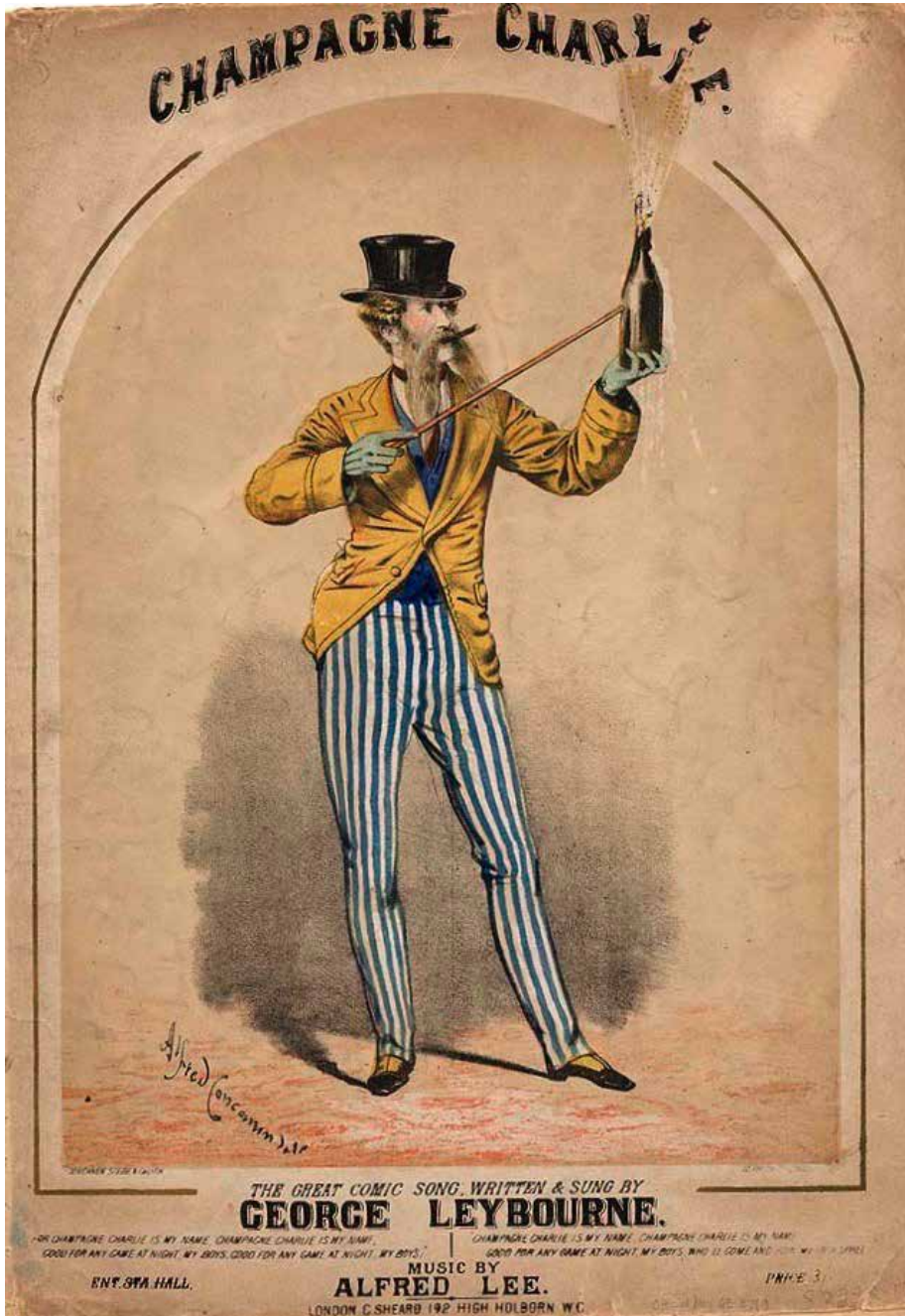
Figure 2: Sheet music title-page depicting George Leybourne as "Champagne Charlie."