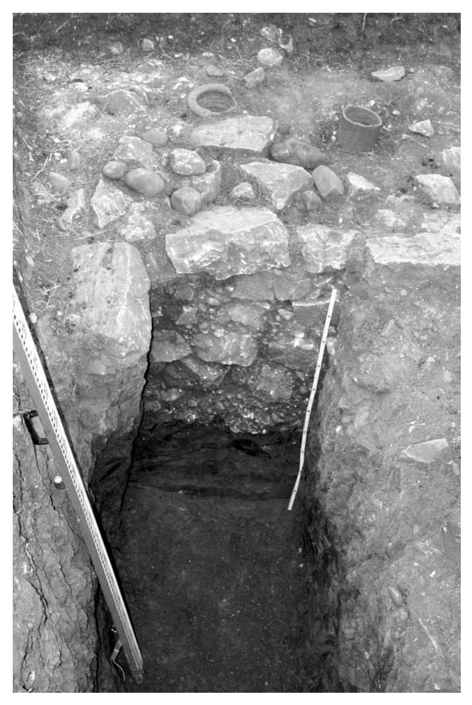
Eastern part of the foundation wall of the structure with embedded ceramic tubuli