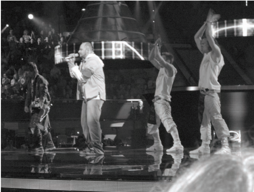
Figure 3. Greenjolly performing at the 2005 Kyiv Eurovision Song Contest

From the top-down perspective, these decisions had as many negative as positive consequences. Some of the decisions made winning the Eurovision much more difficult, and by extension those making the decisions risked marginalizing issues of politics and diversity. Such marginalization could not have been at greater risk than in the case of Ukraine’s 2005 entry, Greenjolly’s “Razom naz bahato, nas nye podoloty” (“Together We Are Many, We Cannot Be Defeated”).