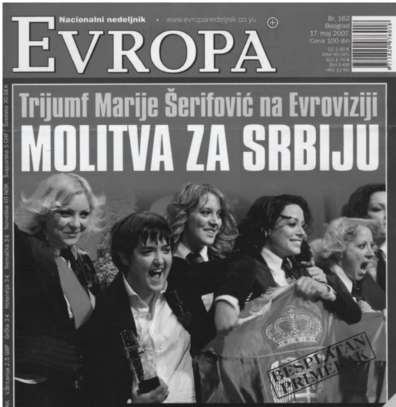
Figure 1. Cover of Evropa (17 May 2007), with images of the aftermath of the Serbian Eurovision victory

Or had it? Is the pronouncement of a new era, a revolution, within one of Europe's most established and complex musical institutions a bit premature? And what does it really mean to be "new" in an aesthetic and political network that so repeatedly insists upon reviving and remembering the "old?"