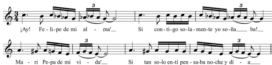
Figure 3. Duet “¿Por qué de mis ojos...?” from the zarzuela La revoltosa , Bars 42–9.