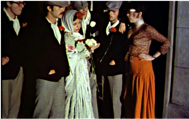
Figure 4. Still frame from the film Pepi, Luci, Bom and Other Girls on the Heap

The musical component of the revenge scene, which operates as a folk based narrative agent, takes on transgressive features, especially when it emphasises female sexuality, subversive sadistic pleasure and enjoyment of physical aggression, tempered by sardonic humour. Indeed, Almodóvar uses Romantic music to depict the poorly executed vengeance plot with a comedic element of body doubles that takes place in the deserted streets of Madrid in the late evening hours.