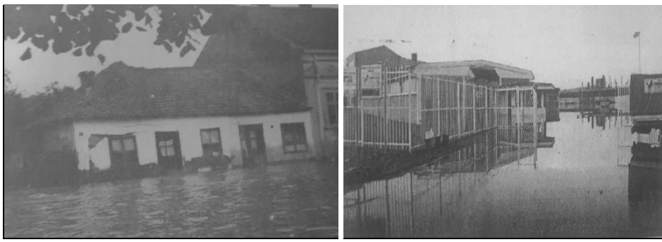
Figure 1. Floods in Despotovac, June 1969; Industry zone in Kragujevac under water, July 1999 (Archive of Inventory of torrential flood events in Serbia. "Politika")

26<sup>th</sup> June 1988, Kostadinov, 1989: Torrential floods in the Vlasina river basin are the consequence of intensive rainfall episode - one third of annual rainfall is poured down in only 4 hours. 500 homes flooded, 80 km of roads and 32 bridges ruined, 3 casualties are the results of this flood event. There were floods of torrents in this river basin with return period of 800 years (Ravna reka).