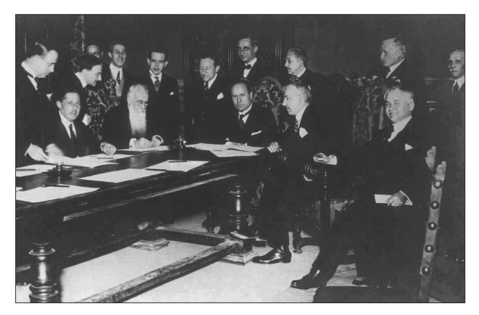
Nikola Pašić and Benito Mussolini sign the treaty of friendship (the Pact of Rome) on 27 January 1924

ship agreement with Belgrade would have the advantage of forcing it to be more amenable to advice of moderation from Paris.<sup>101</sup>