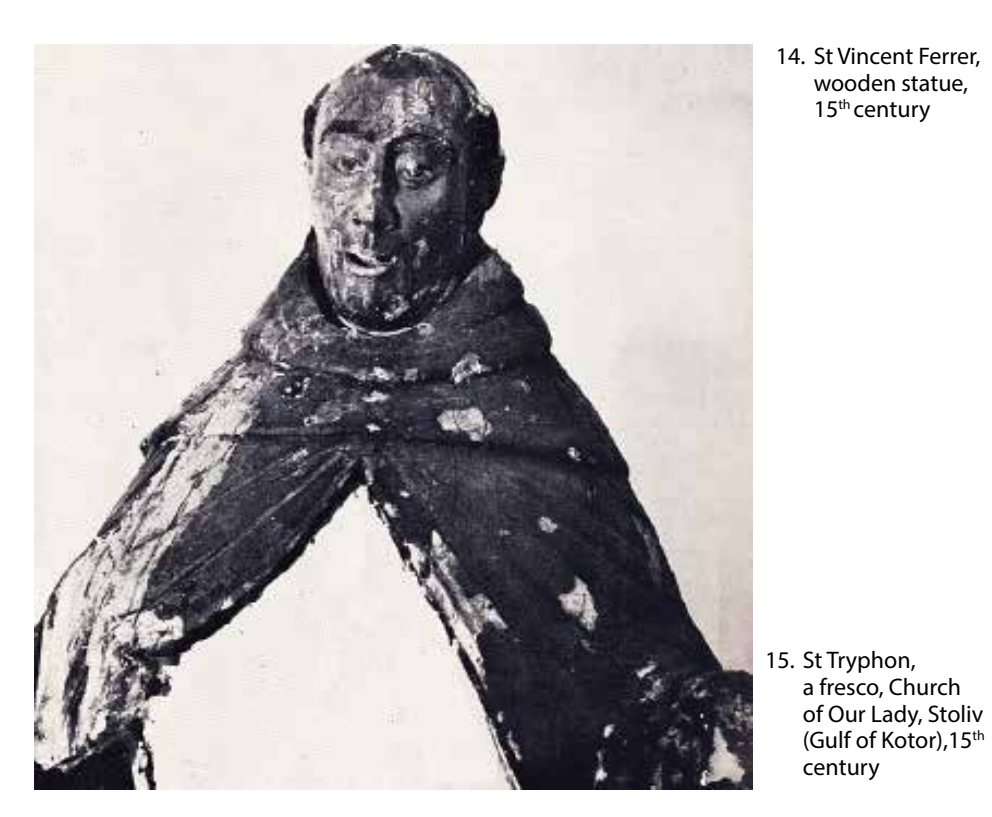
14. St Vincent Ferrer, wooden statue, 15<sup>th</sup>century