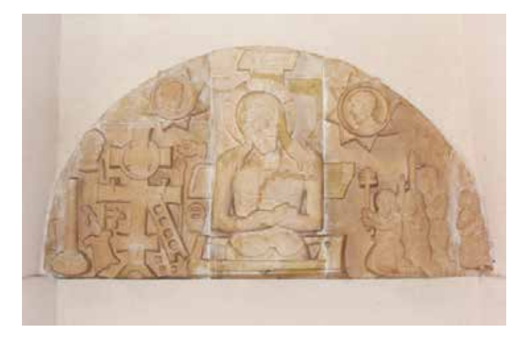
11. Imago Pietatis, relief, 15th century, St Tryphon's Cathedral