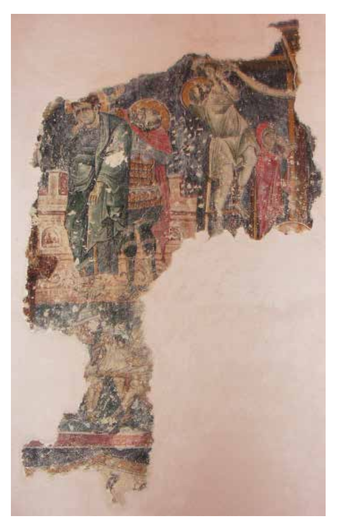
5. Crucifixion and Descent from the Cross, St Tryphon's Cathedral, 14<sup>th</sup> century

3. St Catherine of Siena, St Anne's church, 15th century