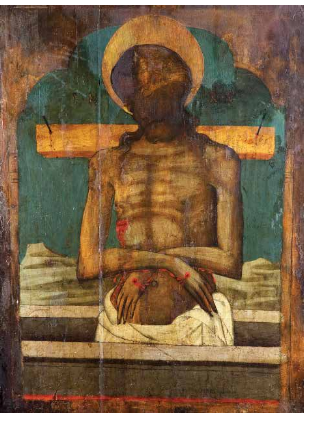
12. : Imago Pietatis, double-sided icon, 15<sup>th</sup> century, St Tryphon's Cathedral