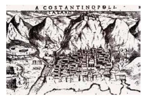
1. Cattaro, Giuseppe Rosaccio, engraving, 16<sup>th</sup> century