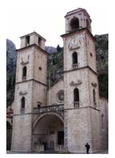
4. St Tryphon's Cathedral