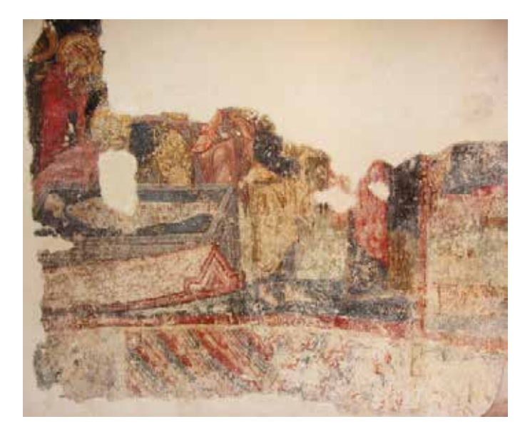
8. Apostles Discovering the Empty Tomb, St Mary's Collegiate church, 14<sup>th</sup> century

7. Mocking of Christ, St Mary's Collegiate church, 14<sup>th</sup> century