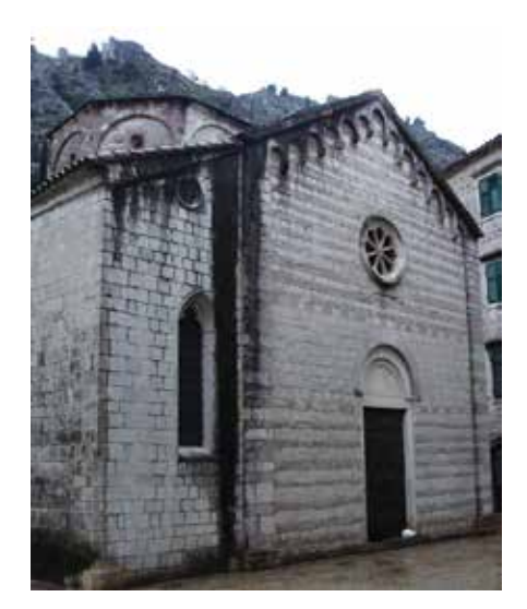
6. St Mary's Collegiate church