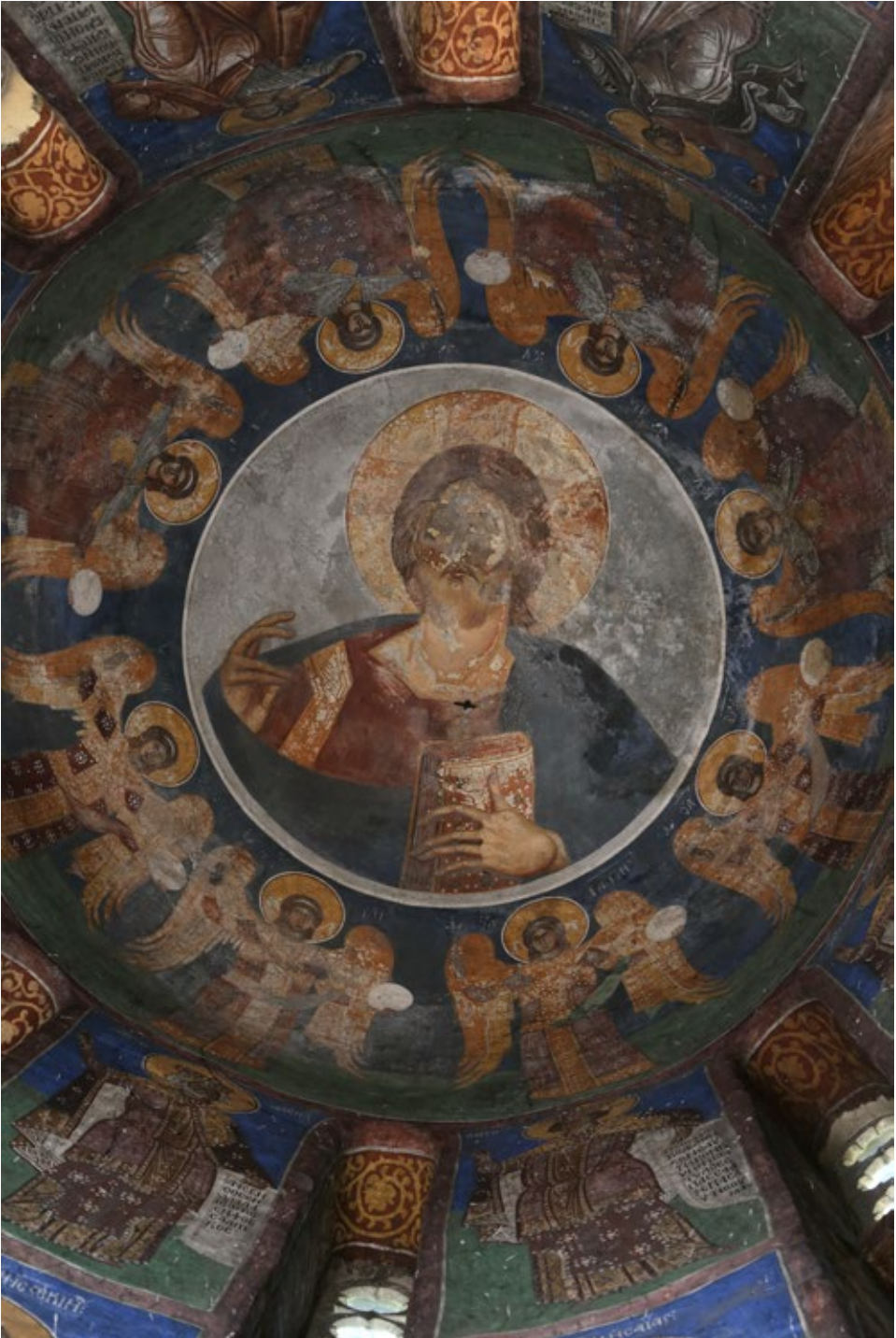
III. 60. Markov Manastir, The Church of St. Demetrios, 1376/1377. Frescoes in the dome.