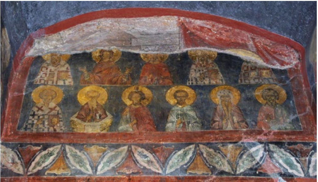
Ill. 62. Zverin monastery, The church of St. Simeon the God-Receiver, 1467. Menologion cycle, November.