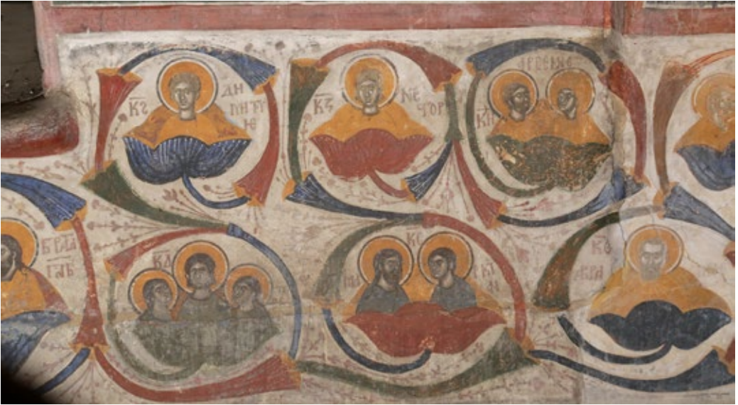
Ill. 61. Markov Manastir, The Church of St. Demetrios, 1376/1377. Menologion cycle, October.