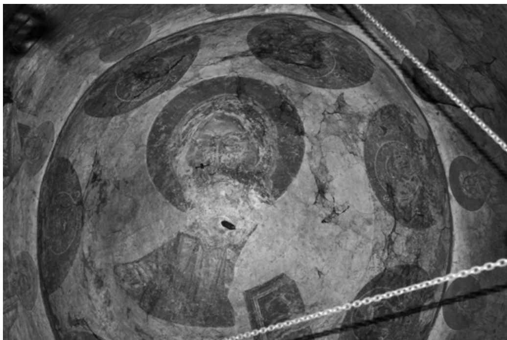
Fig. 2. Prilep, The Church of St. Demetrios, c. 1380, frescoes in the dome.

Zemen (c. 1360) [25, p. 24; 4, p. 169], where extensive damage precludes definite identification. However, the closest parallels for the iconographic and compositional formula adopted at Markov Manastir and Andrejaš are found in the Novgorodian iconographic tradition. The four standing figures of archangels and four six-winged creatures ( seraphim and cherubim ) represented in the church of St. Sophia in Novgorod (1109), were repeated in six Novgorod churches of the second half of the 14 th century: the Assumption in the Volotovo Field (1363) [47, pp. 114–116, figs. 3, 5, 7, 9; 11, pp. 217–233, fig. 4] 2 , the Saviour-Transfiguration in Iliina Street (1378) [20, p. 22, figs. 111, 113, 114] 3 , St. Theodore Stratelates ‘on the Spring’ (c. 1378) [42, pp. 48–55, figs. 10–15] 4 , the Holy Saviour in Kovaliovo (1380) [2, pp. 25–31] 5 , the Nativity on the Red Field (last decade of the 14 th century) [17, p. 90; 42] and Archangel Michael Church in Skovorodsky Monastery (end of the 14 th — beginning of the 15 th century) 6 [19; 22; 34; 35] 7 . In Novgorod, the same thematic concept of the dome remained in use dur-