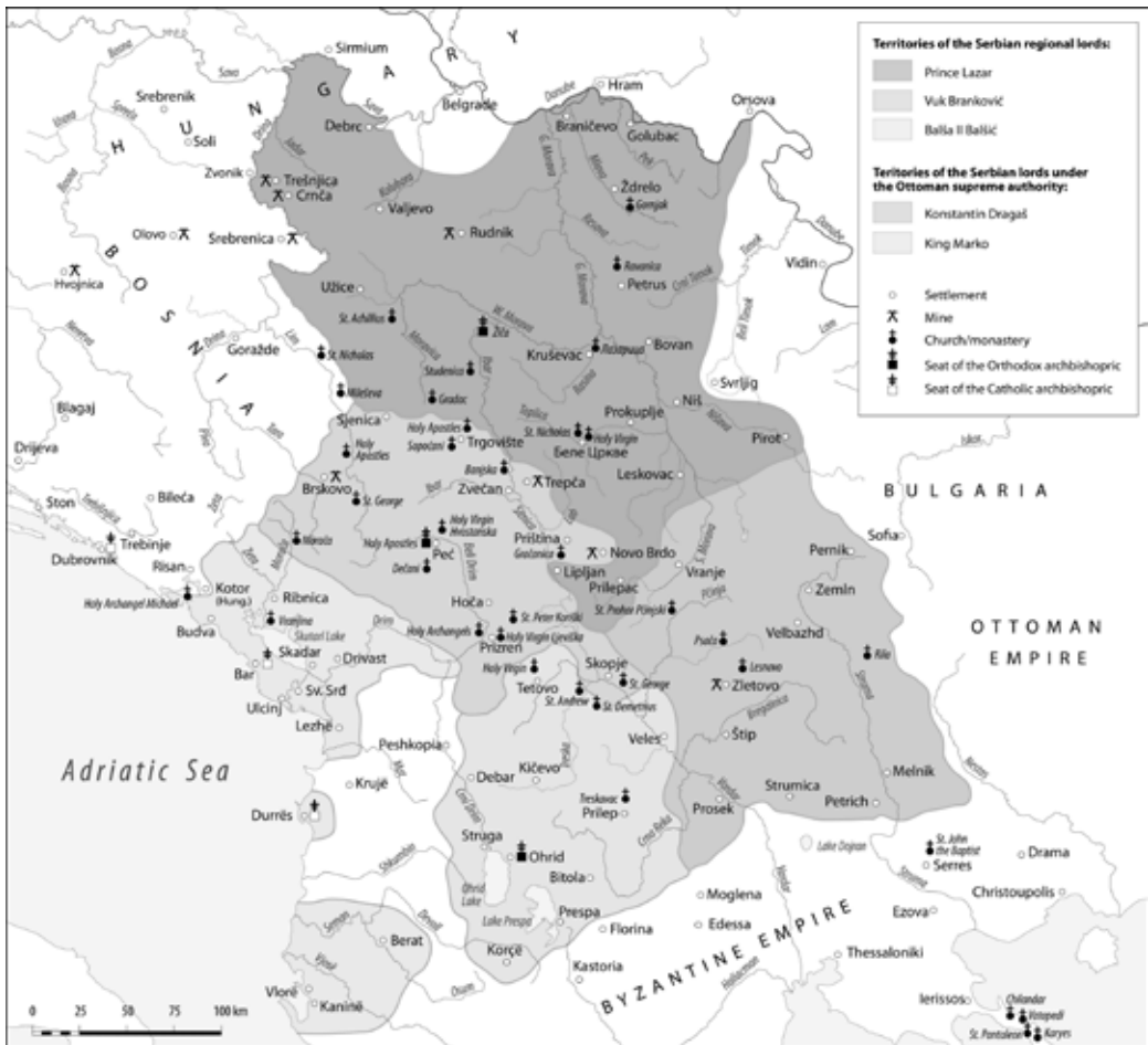
Fig. 1. Map of Serbia in the time of the regional lords, c. 1385 (after: Byzantine Heritage and Serbian Art II, Belgrade, 2016)

their hands [45, pp. 12-13] (Ill. 60). The dimensions of the drum at St. Demetrios in Prilep required a more summarized iconographical depiction of the asomatoi and hence seven medallions with busts of angels dressed in chitons and hematia and holding orbs in their hands surround the Pantokrator [6, p. 87, fig. 2]. The third iconographical solution was left by the painting workshop led by painter Jovan. Like the painters of the Novgorod churches, they also painted four angels, two seraphim and two cherubim, around the now missing image of the Pantokrator in the centre of the dome [32, fig. 3].