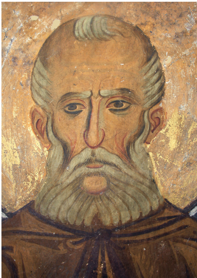
Fig. 21. Studenica, St Sabbas of Jerusalem

templates. However, the remaining observations may seem too speculative and not entirely founded. Be that as it may, we will briefly discuss the sixth figure on the left in the top row and its most distinctive facial characteristic: the unusual beard parted into two strands (figs. 1, 16). Although in this case there are no notable monks whose standardized appearances we could rely on, it should be noted that details often vary in the depictions of some ascetics. For instance, St. Theodosios the Great (the Cenobiarch) was pictured with such a beard in Gračanica and Dečani. 103