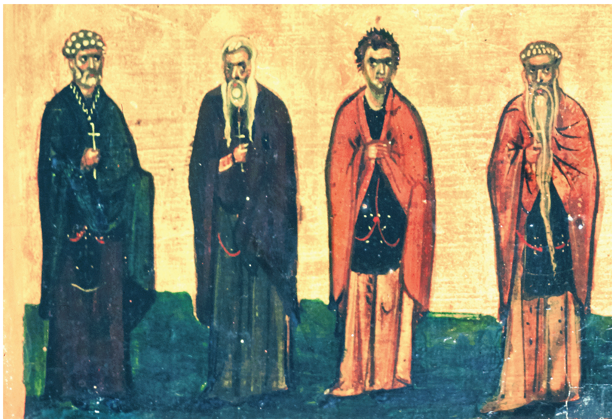
Fig. 18. Sinai, Monastery of St Catherine, Icon of the holy fathers of Raithou, detail (by permission of Saint Catherine's Monastery, Sinai, Egypt. Photograph courtesy of Michigan-Princeton-Alexandria expeditions to Mount Sinai)