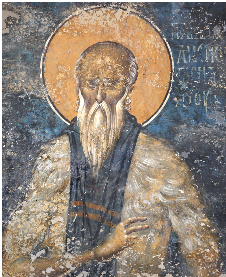
Fig. 12. Dečani, St Paul of Latros

dar (repainted in the nineteenth century) 57 – and in four monuments in medieval Serbia: the Church of the Virgin Hodegetria at the Patriarchate of Peć, 58 Dečani (fig. 12), 59 Lesnovo 60 and Treskavac. 61 In these fourteenth century depictions, the facial features of the hermit of Latros do resemble those of the image in his foundation, but there is a marked difference in his clothing. In Protaton, Peć and Dečani he is dressed like a desert hermit, wearing a fur robe and an analavos over it, while the artist of Lesnovo also added a cloak. 62