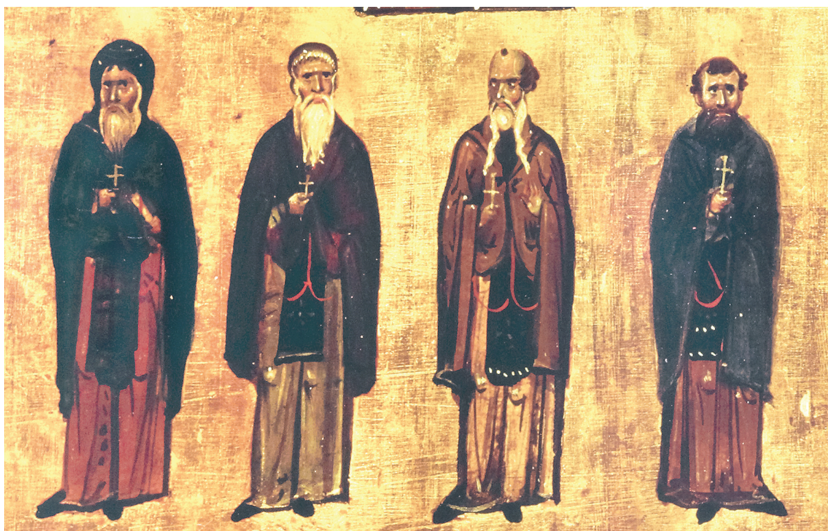
Fig. 16. Sinai, Monastery of St Catherine, Icon of the holy fathers of Sinai, detail (by permission of Saint Catherine's Monastery, Sinai, Egypt. Photograph courtesy of Michigan-Princeton-Alexandria expeditions to Mount Sinai)