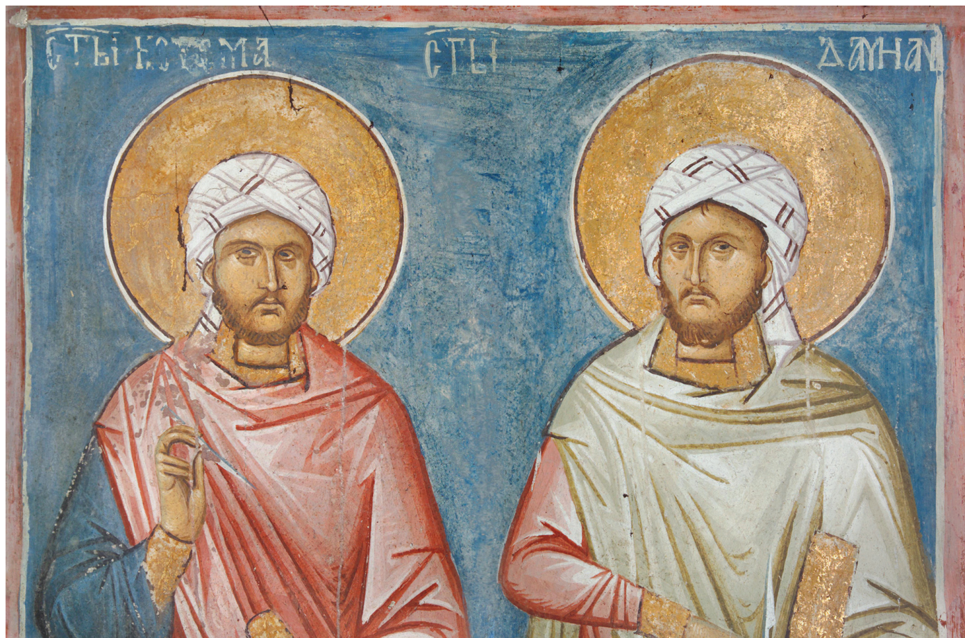
Fig. 20. Dečani, Sts Cosma and Damian of Arabia

ly – seen on representations of Alexios the Man of God, such as that in the Monastery of Panagia Mavriotissa in Kastoria (fig. 19). 95