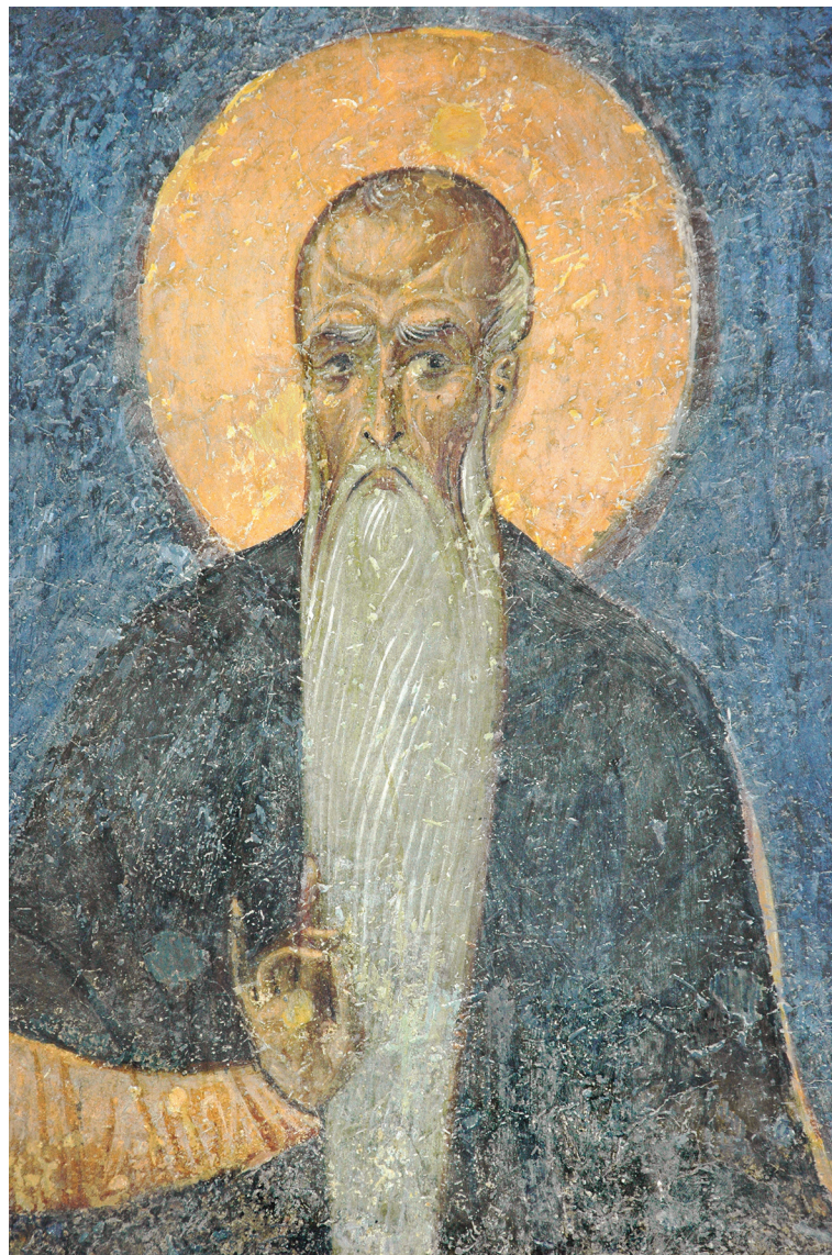
Fig. 15. Nerezi, St Euthimius the Great

In comparison with some other interesting group depictions in East Christian iconography, the Sinai icons display a high level of originality in regard to the distinctiveness of the depicted physiognomies. The successful characterization of the martyrs' "portraits" on the Sinai icons is rivaled only by the most accomplished depictions of another group of notable martyrs, which is equal in number to the Sinai and Raithou groups: the Forty Martyrs of Sebaste. This is evidenced by their frontal group portrait in the menologion from the University Library of Messina (eleventh century, San Salvatore 27, fol. 190v), 77 a miniature in the Moscow Imperial Menologion for February and March from the same century [State Historical Museum, Vlad. 376 (Syn. gr. 183) , fol. 179r], 78 an exceptionally well-executed thirteenth century icon kept at the Svaneti Museum in Mestia (Georgia) 79 and the well-