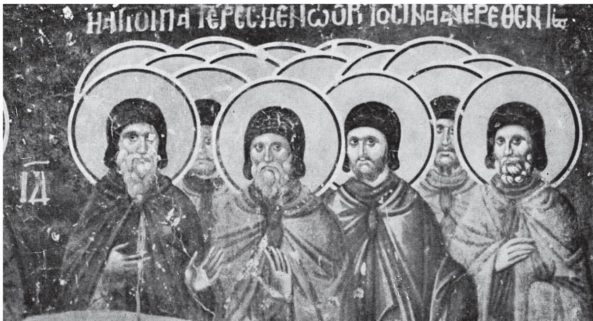
Fig. 6. Staro Nagoričino, Menologion, Holy fathers of Sinai (after: Mijović, Menolog)

south side by, among other buildings, a chapel dedicated to the Sinai and Raithou fathers; a chapel dedicated to forty martyrs (probably the Holy Forty of Sebaste); as well as another chapel dedicated to “another forty martyrs, slain for following Jesus by those Arabs who called themselves Blemmyes, and whose relics lie there.” 20 This description, however, seems unreliable. Presumably, the author misunderstood the dedications of the chapels he mentions, since it was not “another forty” who were slain by the Blemmyes, but precisely the monks of Raithou, to whom he claims that the first chapel was dedicated together with the martyrs of Sinai. Hence, this source cannot be treated as a trustworthy testimony suggesting that the veneration of the Sinai and Raithou monks was tied to more than one parekklesion in the sixteenth century. In addition, the credibility of this description is further damaged because it seems not to have been based on Zygomalas’ personal visit to the monastery, but on an older text used by the author. 21