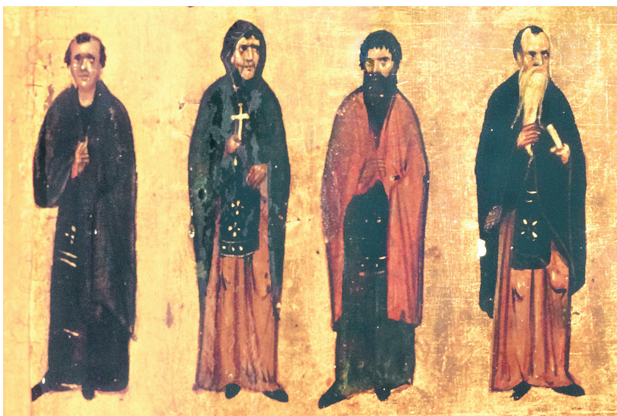
Fig. 17. Sinai, Monastery of St Catherine, Icon of the holy fathers of Sinai, detail (by permission of Saint Catherine's Monastery, Sinai, Egypt. Photograph courtesy of Michigan-Princeton-Alexandria expeditions to Mount Sinai)

only fragments of both examples that provide evidence of this have survived to this day. These examples are two standing ivory figures, the work of a tenth century Constantinopolitan master, which were once probably parts of the epistyle in the altar screen of a chapel dedicated to the Holy Forty of Sebaste, and a few preserved frescos in