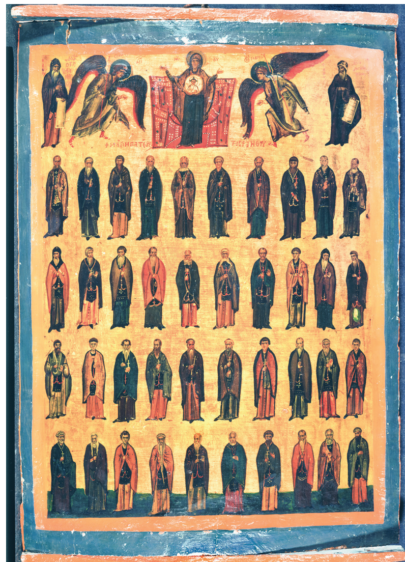
Fig. 1. Sinai, Monastery of St Catherine, Icon of the holy fathers of Sinai (by permission of Saint Catherine's Monastery, Sinai, Egypt. Photograph courtesy of Michigan-Princeton-Alexandria expeditions to Mount Sinai)