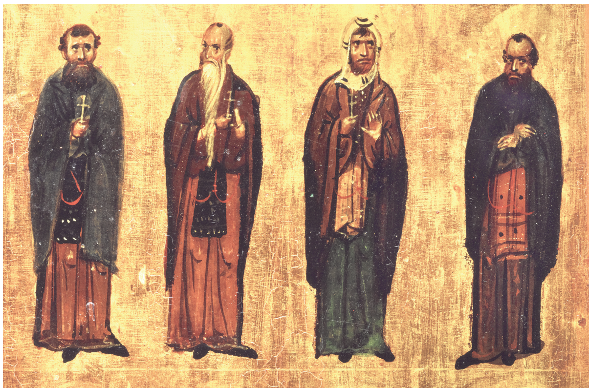
Fig. 14. Sinai, Monastery of St Catherine, Icon of the holy fathers of Sinai, detail

that it was brought there from Latros? In addition to the aforementioned stylistic characteristics of the icon, some of its other features also seem to suggest this possibility. For example, particularly striking is the artist's familiarity with St. Paul's iconography – the remarkable similarity of his representation on the Sinai icon to that in Latros cave church; in addition, this saint is positioned on the left, hierarchically superior side of the extended Deesis, which is certainly significant. In other words, the reason behind the presence of the Latros hermit could have been the will of the donator and not the veneration of this saint at the Sinai monastery. Of course, we can do no more here than to merely indicate the possibility that the icon of the Holy Fathers of Sinai and Raithou had originated from Latros, to be confirmed or refuted in future studies.