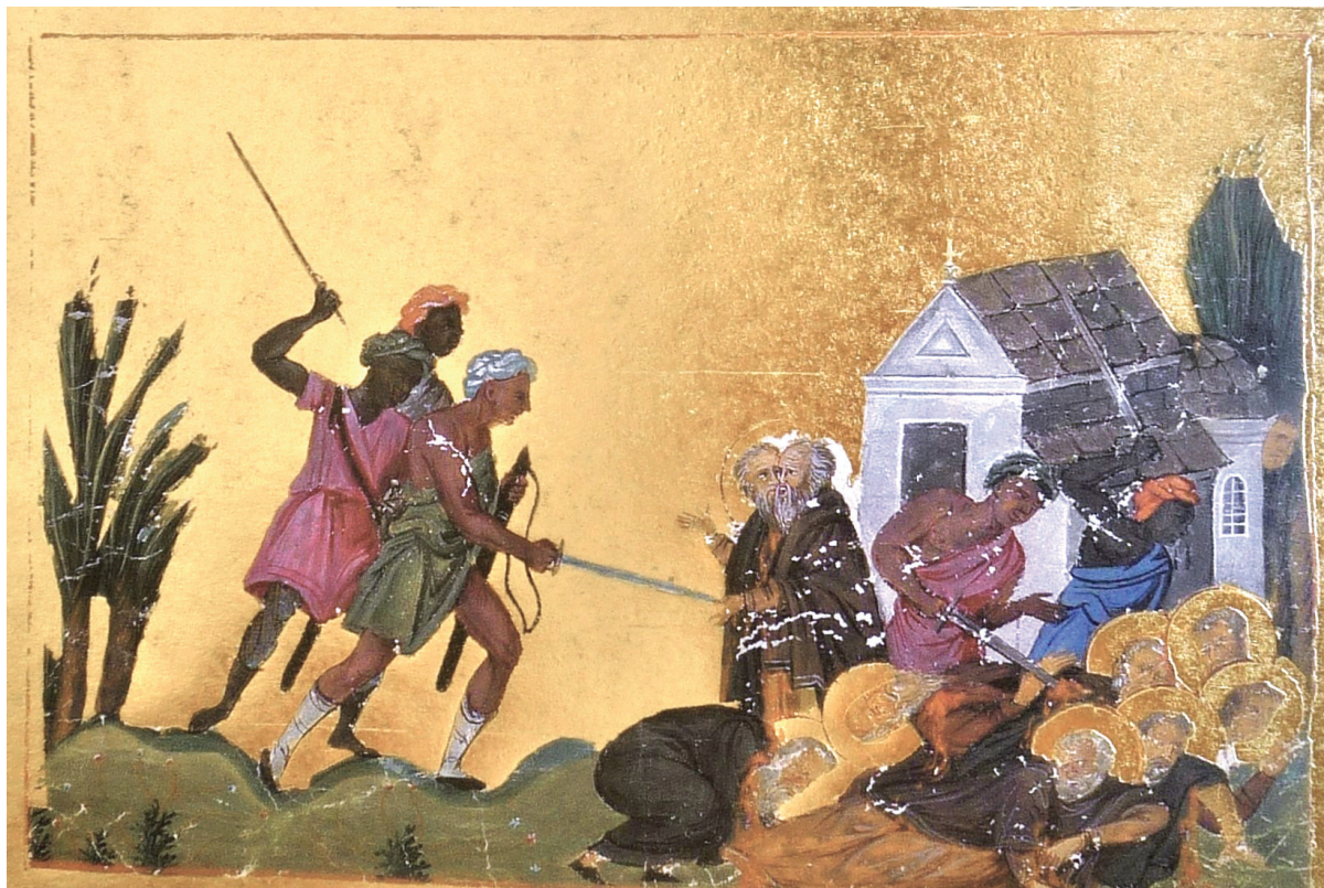
Fig. 5. Menologion of Basill II, Bibliotheca Apostolica Vaticana (Vatic. gr. 1613), fol. 317 (after: El Menologio de Basilio II)

Sinai and Raithou were venerated in the very same chapel that is today named after them.