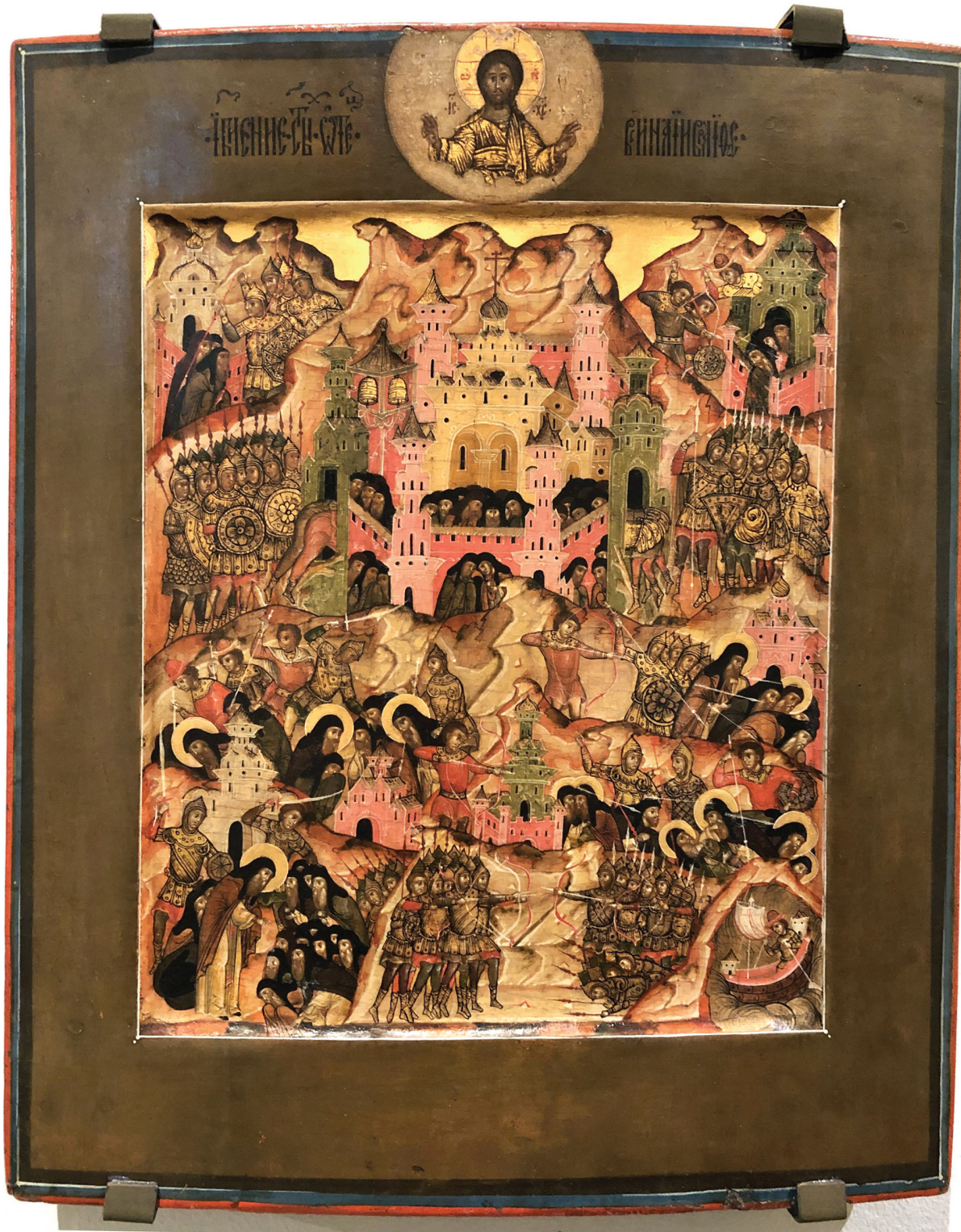
Fig. 8. Moscow, State Russian Museum, Icon of the holy fathers of Sinai and Raithou

ter of the Raithou fathers is also depicted in the aforementioned Baltimore menologion (fol. 92v), again featuring