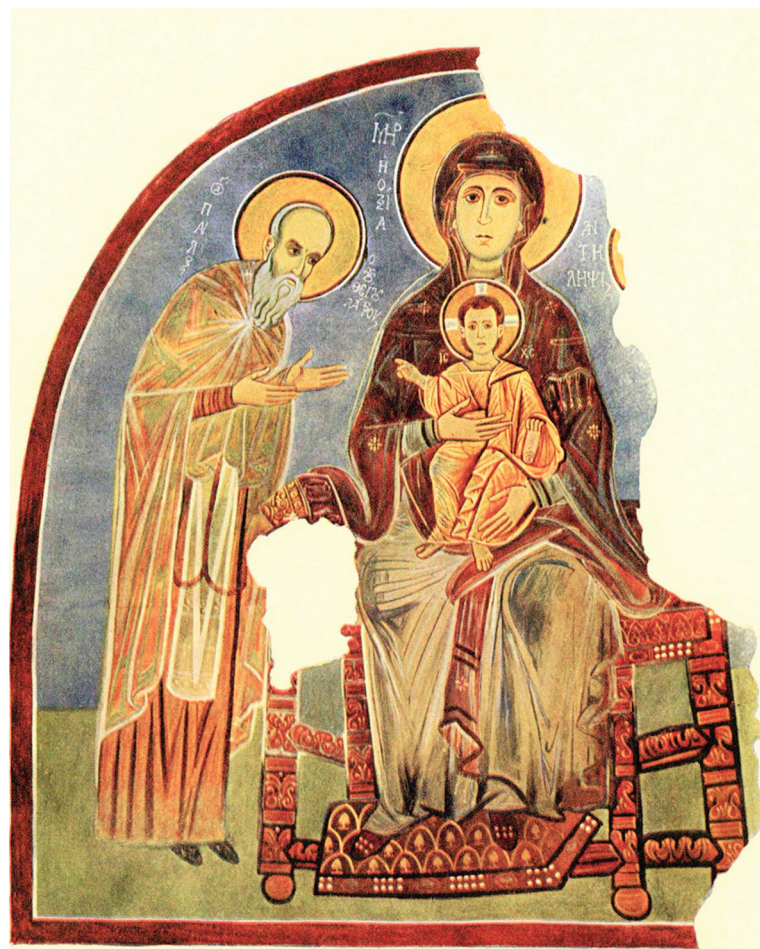
Fig. 11. Latros, Monastery of the Mother of God tou Stillou, Cave of St. Paul of Latros, St Paul of Latros approaching the Virgin with Christ, copy (after: Wulff, Die Malereien der Asketenhöhlen des Latmos)

survived. His oldest representations are found on the frescoes painted on the walls of the cave outside the walls of his monastery. The first of these closely resembles the figure on the Sinai icon both formally and iconographically. This depiction is situated in the conch of the altar apse and shows St. Paul as an older man with a high forehead and a white, relatively short beard split into several strands approaching the figure of the Virgin in supplication. Unfortunately the representation of his counterpart on the other side has been destroyed (fig. 11). The north wall of the cave features a representation of the Dormition of Paul. 55 All other preserved images of this saint were created much later, in the fourteenth century. He is depicted in the churches of Athos – Protaton 56 and Hilan-