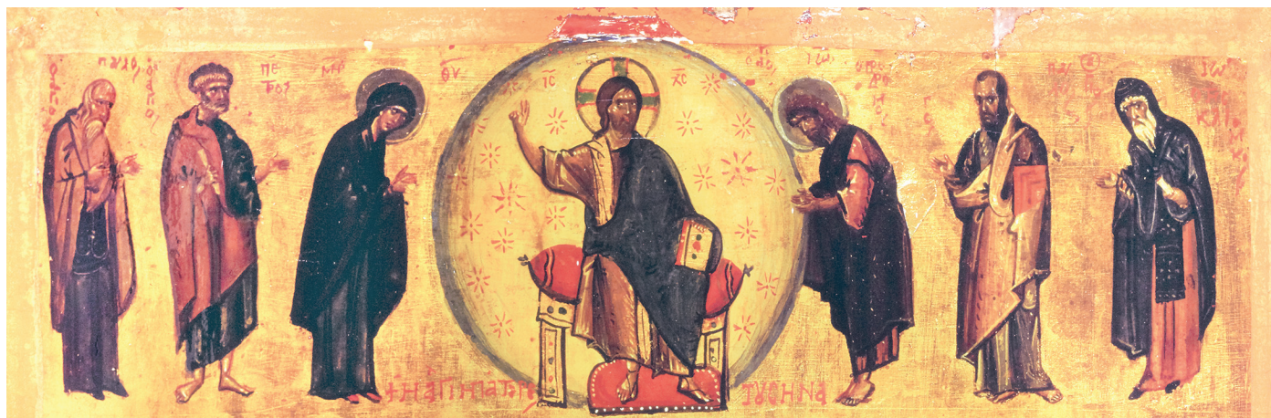
Fig. 9. Sinai, Monastery of St Catherine, Icon of the holy fathers of Sinai, upper register

Psalter from the British Library in London ( Add. 19.352 , fol. 111r), which was made in 1066 in Constantinople, 33 and on a heavily damaged miniature in the Menologion of Demetrios Palaiologos, dating from the mid fourteenth century and kept at the Bodleian Library in Oxford ( MS Gr. th. f. , fol. 25r). 34 Expectedly, the slaughter of the Sinai fathers is also depicted on an icon-hexptych from the eleventh century at St. Catherine's Monastery. 35 As regards monumental art, there are two extant examples in Serbian medieval churches frescoed in the fourteenth century: the calendar illustrations in Staro Nagoričino, which feature only the Sinai martyrs on frontal portraits and busts (fig. 6), 36 and in Dečani, which houses a heavily damaged image of the monks' slaughter. 37 Like in Staro Nagoričino, the Greco-Georgian Menologion from the late fifteenth century kept at the Russian National Library ( Paz. O. I. 58, fol. 96) does not depict the slaughter itself but instead shows a group of martyrs, this time standing and holding crosses in their hands. 38