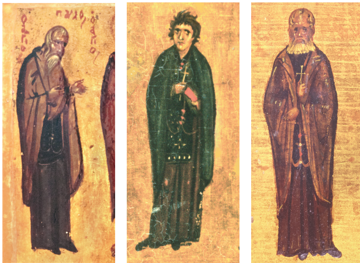
Fig. 10. Sinai, Monastery of St Catherine, Icon of the holy fathers of Sinai, a. St Paul of Latros, b. detail, c. detail

among the Russian examples is a seventeenth century icon painted by Master Pervusha, a member of the so-called Stroganov icon-painting school, now kept in The State Russian Museum, Moscow (fig. 8). Actually, besides the icons from St. Catherine's Monastery, this is the only stand-alone icon of the monks of Sinai and Raithou known to us. In the compositional and iconographic sense, this depiction is very complex and exceptionally narrative and was painted in the manner of historical compositions traditionally found in Russian illustrated chronicles. In addition to the slaughter of the abbas , the icon extensively depicts the battle between the Blemmyes and the citizens of Pharan, who came to the aid of the Raithou brotherhood. 44