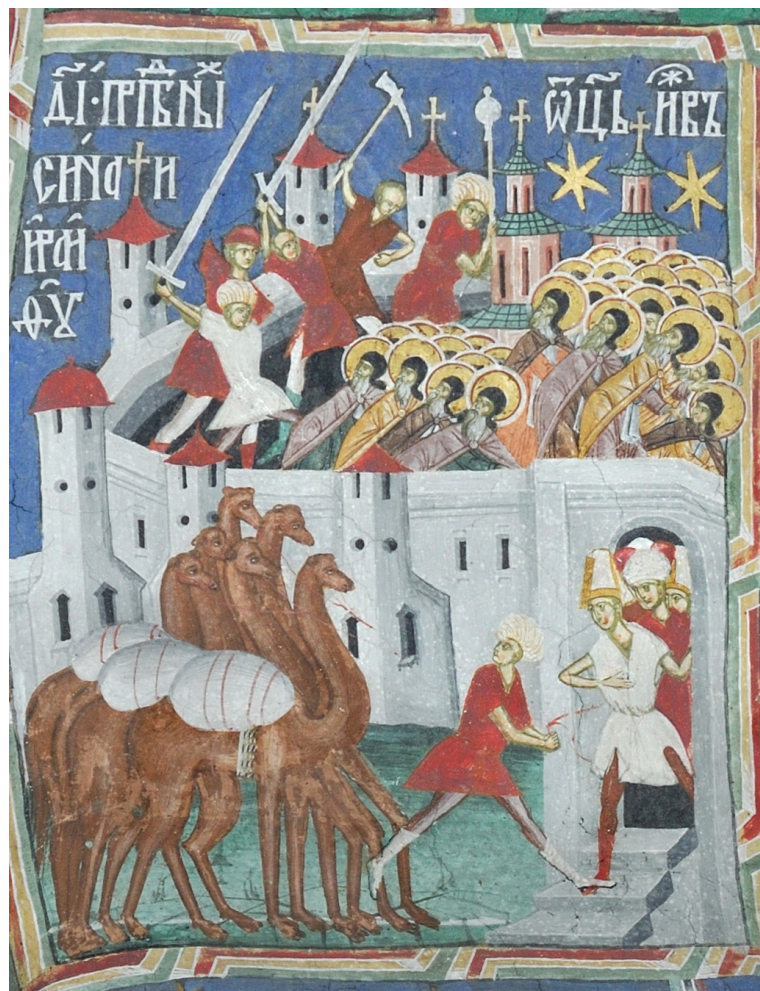
Fig. 7. Sucevița, Menologion, Martyrdom of the fathers of Sinai and Raithou

Of certain significance for the study of the cult of Sinai and Raithou Holy Fathers are also their visual representations. 26 When it comes to the local reflection of their veneration in art, then, in addition to the icons that are the main subject of our study, it is necessary to mention another icon from the treasury of the Monastery of Saint Catherine. In the upper register of the icon in question, also painted in the thirteenth century, there is a composition of the Great Deesis, and in the lower four rows there are standing, frontal figures of saints. 27 On the right side of the second zone from below, opposite the figures of nine famous holy monks (St. John Climacus, Sabbas, Euthymius, Ephraem, Theodore of Stoudius, Pachomius, Arsenius, Paul of Thebes, Anthony), the same number of figures of the fathers of Sinai and Raithou is represented.