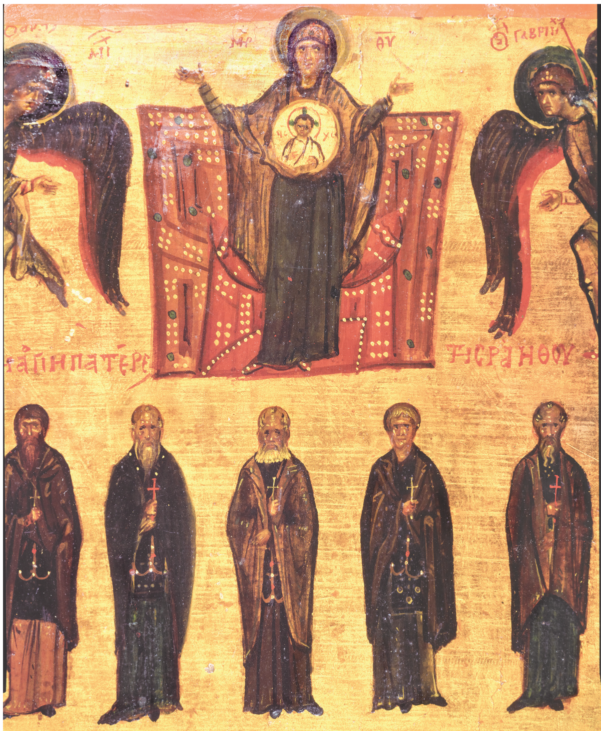
Fig. 13. Sinai, Monastery of St Catherine, Icon of the holy fathers of Raithou, middle upper register

In view of these similarities in style, could one entertain the thought that the icon of the Holy Fathers of Sinai and Raithou was painted on Mount Sinai by an artist from Asia Minor 69 (i.e. from the Empire of Nicaea, if the dating to the thirteenth century is correct)? Although this question requires a more detailed and comparative