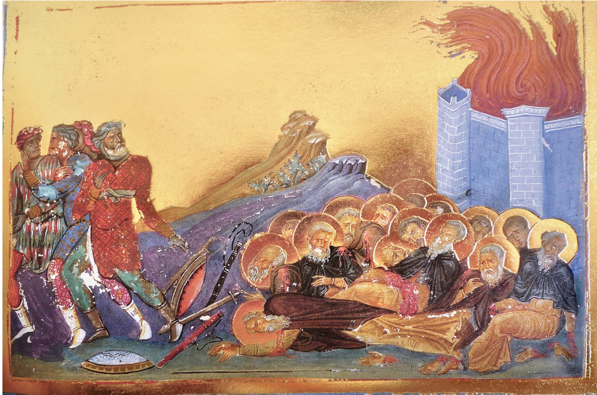
Fig. 4. Menologion of Basill II, Bibliotheca Apostolica Vaticana (Vatic. gr. 1613), fol. 316 (after: El Menologio de Basilio II)

The veneration of the Sinai and Raithou martyrs' cult at St. Catherine's Monastery is even today evidenced by the easternmost lateral chapel located on the south flank of the main church and connected by a door to the central Chapel of the Burning Bush , which is situated behind the altar apse (fig. 3). 12 This "Chapel of the Holy Fathers" houses an undated marble inscription, which mentions the martyrdom of the "the equal-in-number Holy Fathers" who "lie in this place". Its contents, particularly the number "four (and) ten" (τῆς δ̄ δεκάδος) which is found at the beginning, have proved difficult to interpret, and scholars have yet to reach a consensus on whether it indicates the number of slain monks (40) or the date of their slaughter (14 January). 13 In addition, several authors are skeptical about the possibility that the inscription was always located at this spot; in other words, they remain unconvinced that the parekklesion was originally intended to serve as a shrine of the martyrs of Sinai and Raithou. Some scholars have even expressed doubts that their relics were ever housed in this lateral chapel. 14