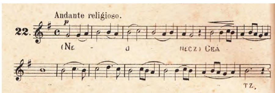
Musical example 5. Neanes - Holy, Holy, Holy , from the Eucharistic Prayer (a part), Gavriilo Boljarić, Nikola Tajšanović, Serbian Orthodox Chant According to the Old Karlovci Usage , Book 4, Sarajevo 1889, p. 48 (Institute of Musicology, SASA).

Numerous Serbian collections may be distinguished by a special feature of Greek tradition: that is the use of the intonation formula ( neanes ) at the beginning of the hymn Holy from the Eucharistic Prayer (ex. 5) and the communion hymn On the Mountain of Sinai .