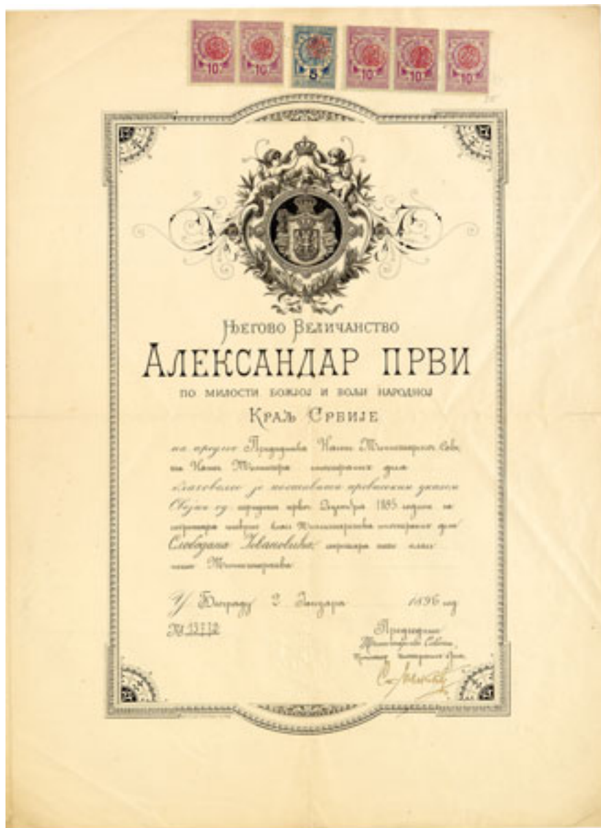
The royal decree issued by King Aleksandar I (Obrenović) by which Slobodan Jovanović, 5 th class secretary, was promoted to 4 th class secretary in the Ministry of Foreign Affairs (31 December 1895; 2 January 1896) (ACCHPF)