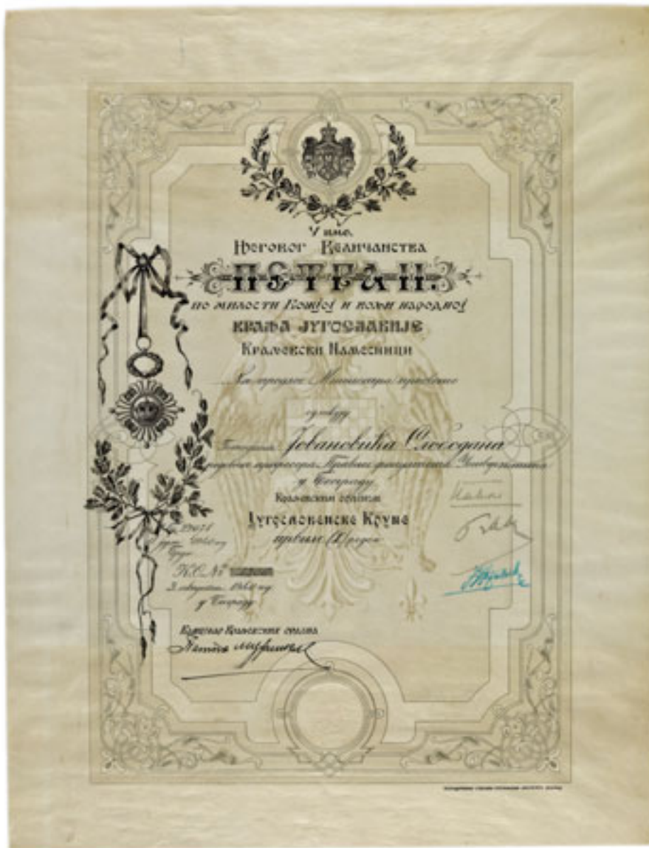
The royal decree issued by the Royal Regency, on behalf of King Petar II (Karadjordjević), by which Slobodan Jovanović, a full professor of the University of Belgrade Faculty of Law, was awarded the Order of the Yugoslav Crown, 1 st Class (3 August 1940)