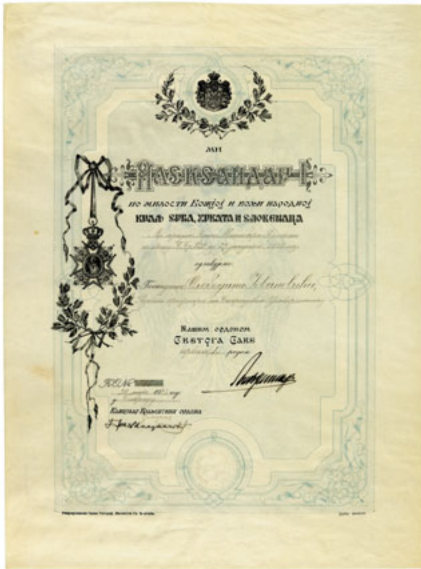
The royal decree issued by King Aleksandar I (Karadorđević) by which Slobodan Jovanović, a full professor of the University of Belgrade, was awarded the Royal Order of St Sava, 1 st Class (30 May 1923)