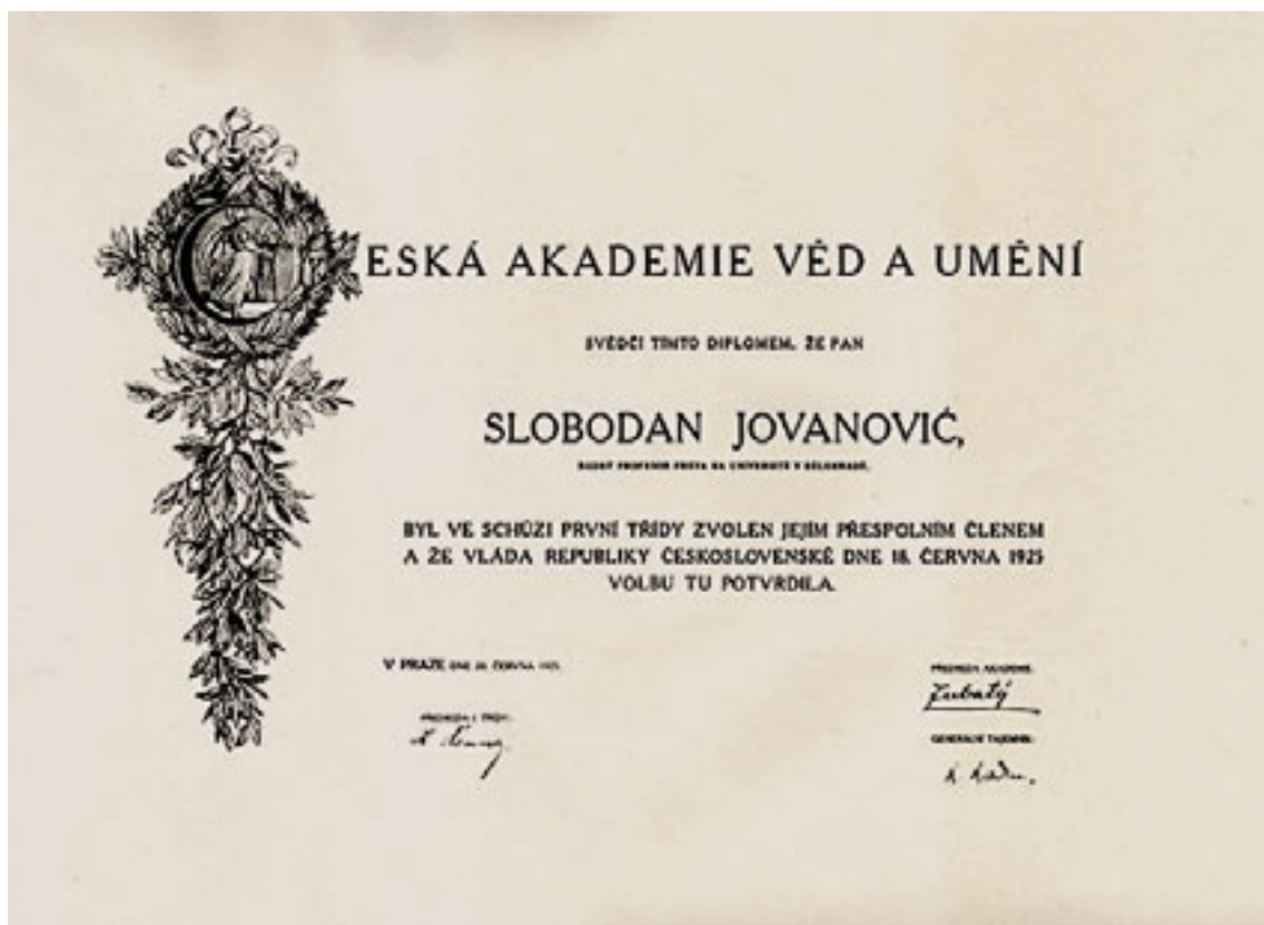
Prague, 29 June 1925 Czech Academy of Sciences and Arts Foreign Member Election Certificate (ACCHPF)