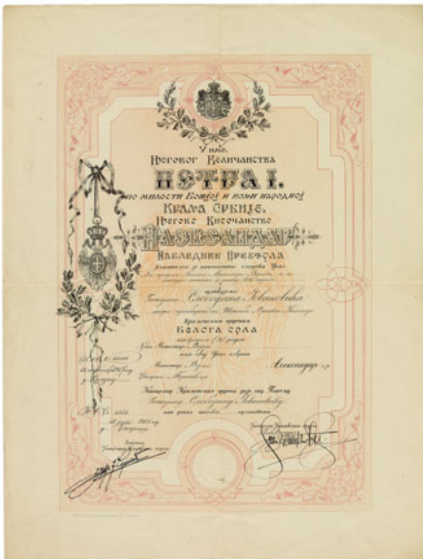
The Charter on the Decree issued by Prince Regent Aleksandar (on behalf of King Petar I) by which Slobodan Jovanović, who served as the head of the Press Bureau of the Supreme Command Headquarters, was awarded the Order of the White Eagle, 4 th Class, for his meritorious service during the war 1916. (Thessaloniki, 12 September 1917; Belgrade, 15 July 1928)