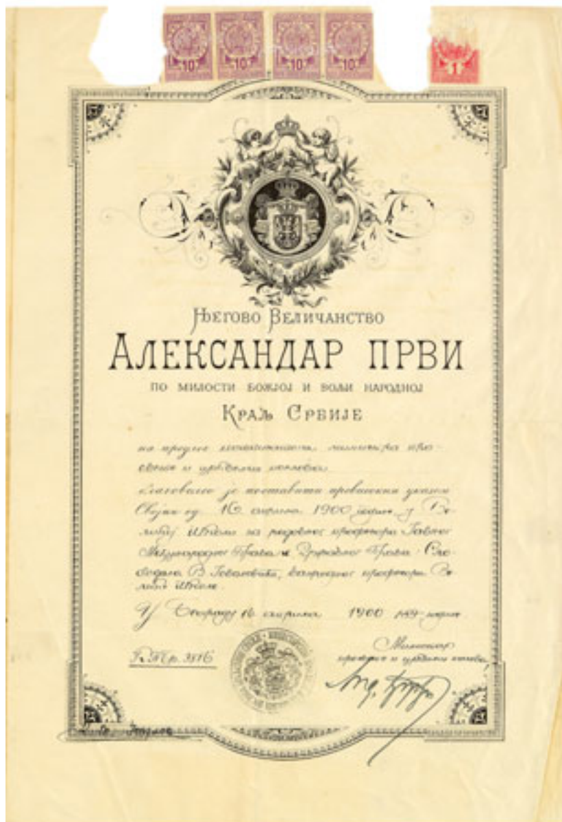
The royal decree issued by King Aleksandar I (Obrenović) by which Slobodan Jovanović was given full professorship of Public International Law and Public Law (16 July 1900) (ACCHPF)