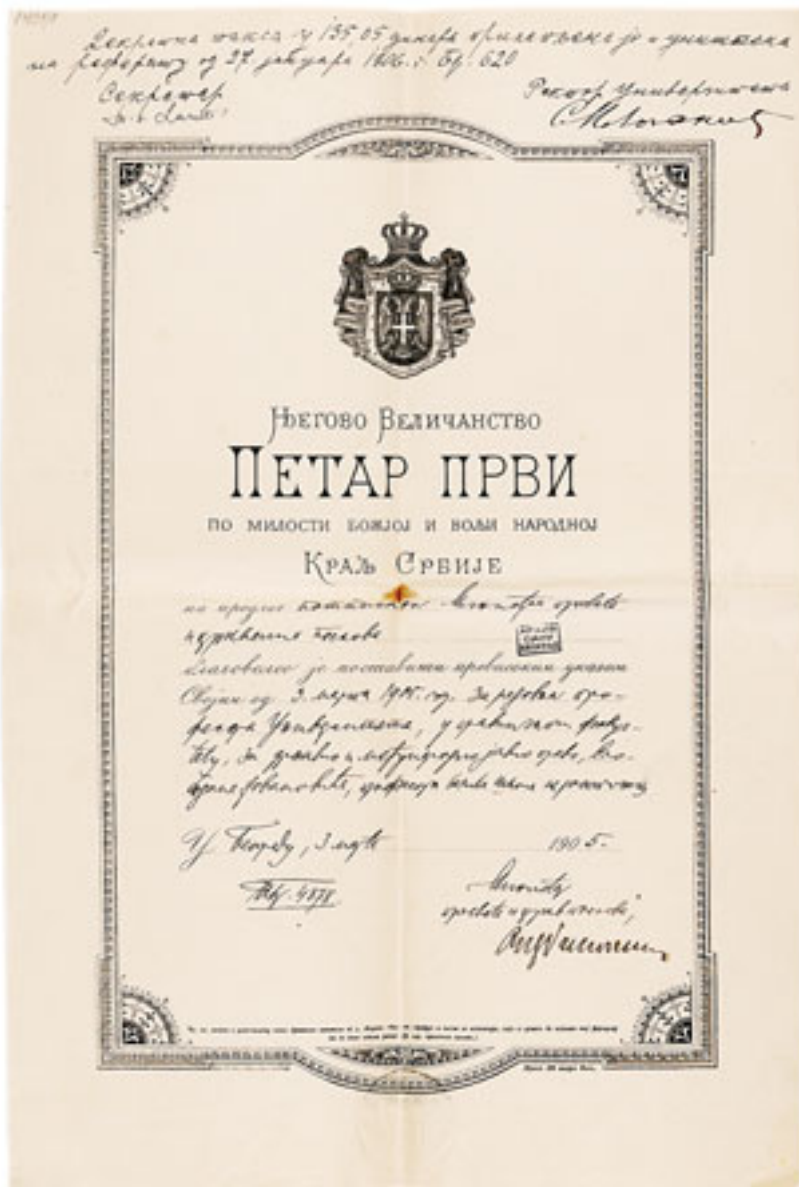
The royal decree issued by King Petar I (Karadorđević) by which Slobodan Jovanović, a full professor of the Grand School, was given full professorship of Public Law and Public International Law at the University of Belgrade Faculty of Law (3 March 1905)