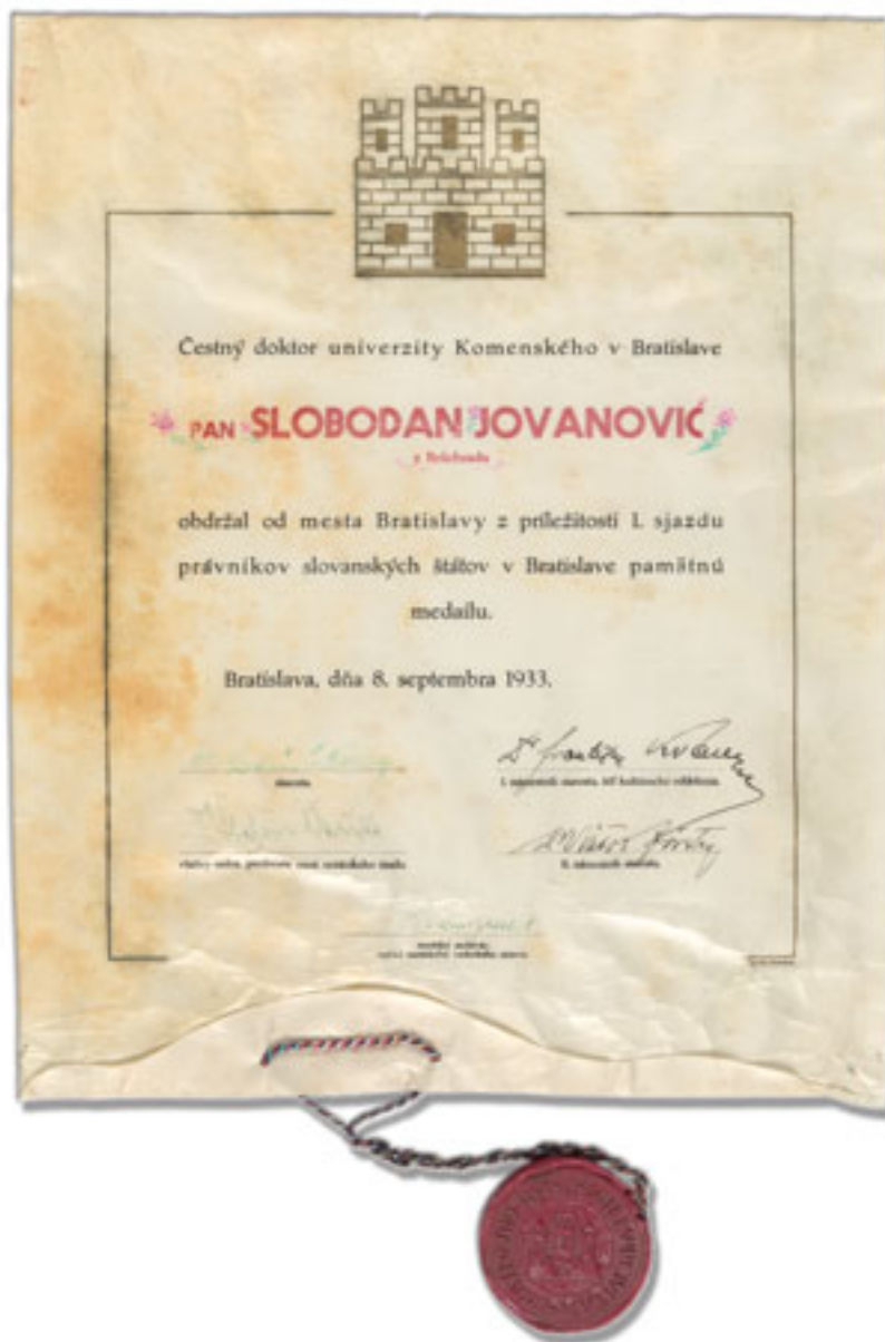
Honorary Doctorate Degree in Law from the University of Bratislava (8 September 1933)