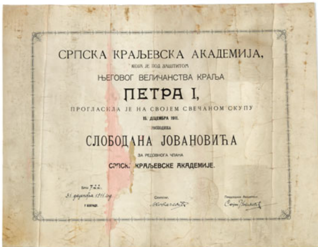
Slobodan Jovanović's Serbian Royal Academy Full Member Election Certificate (15 December 1911; 31 December 1911) (ACCHPF)