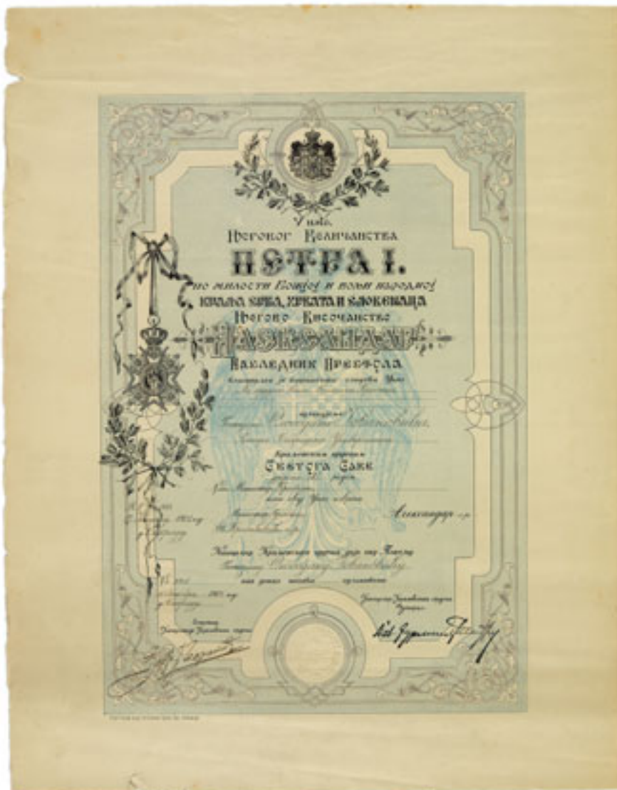
The Charter on the Decree issued by Prince Regent Aleksandar (on behalf of King Petar I) by which Slobodan Jovanović was awarded the Order of St Sava, 2 nd Class (27 January 1921; 11 October 1921) (ACCHPF)