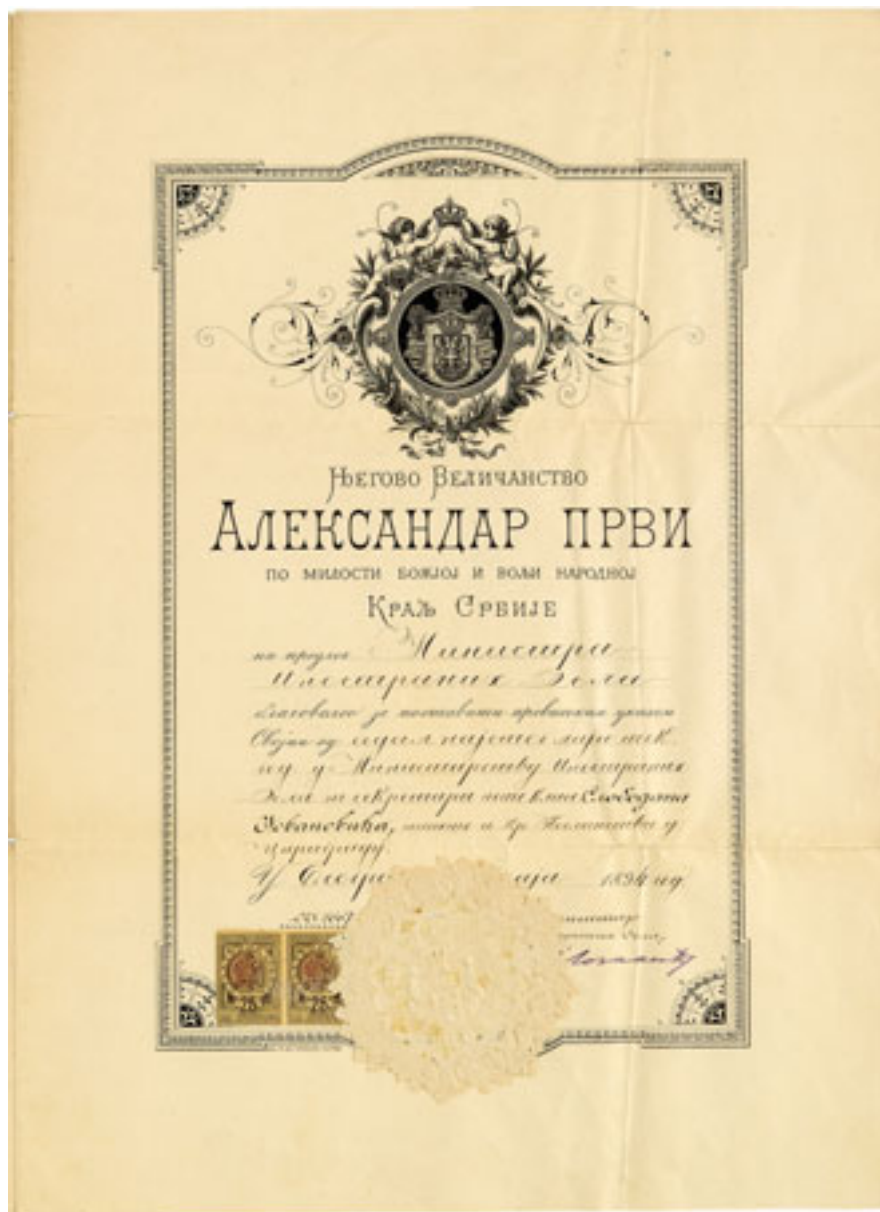
The royal decree issued by King Aleksandar I (Obrenović) by which Slobodan Jovanović was appointed as an attaché to the Serbian legation in Constantinople (1894) (ACCHPF)*