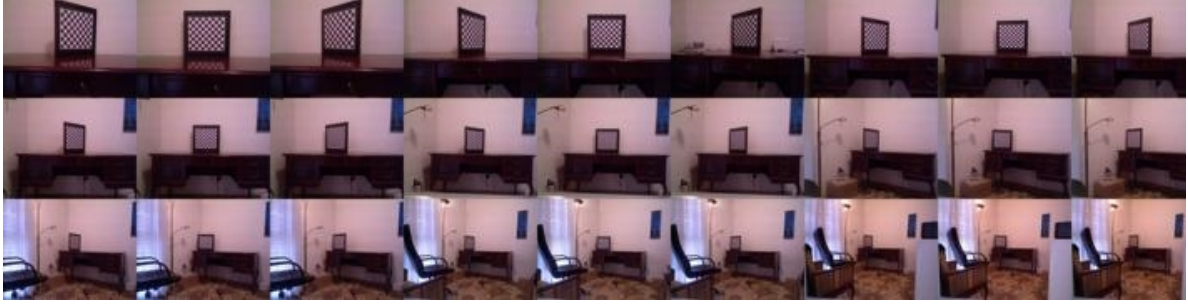
Figure 2. Calibration images

of homogeneous 3D coordinates from RGB to IR camera frame.