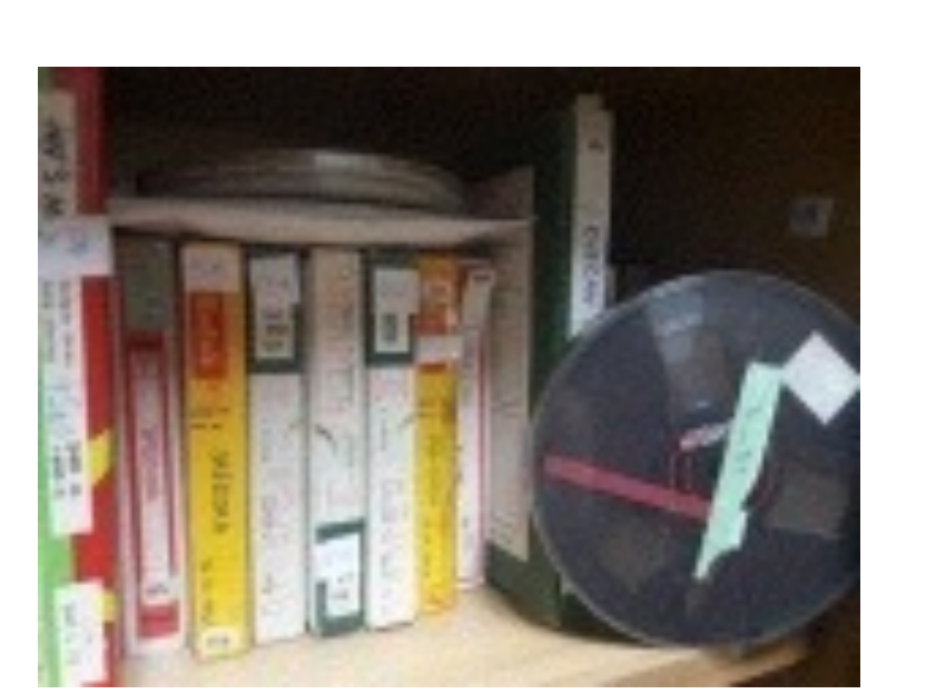
Figure 3. Wire reels.