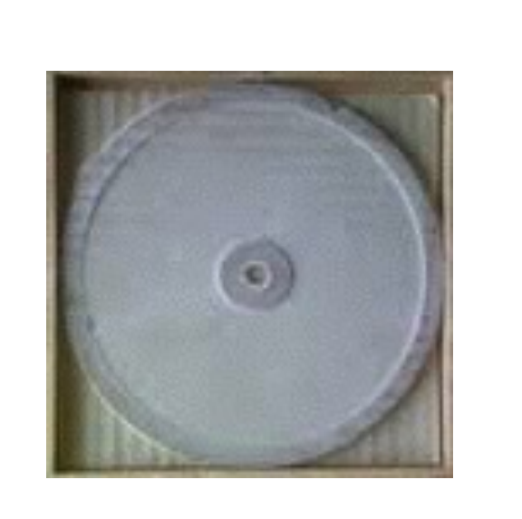
Figure 2. Wax plate.