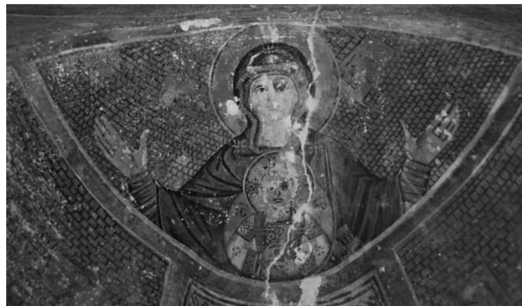
Fig. 10. Sopoćani, prothesis, The Virgin with the Christ Child

Symeon of Thessalonike's text on the ritual of the consecration of a church further prescribes that a bishop should cover his hands with cloth – like cuffs united with the shroud: Καὶ ἐν ταῖς χερσὶ δὲ ὁμοίως. μανδύλια περιτίθεται, ὡς μανίκια ἠνωμένα τῇ σινδόνι. 59 The border on the ends of the sleeves of Christ Emmanuel in the semi-dome of the apse at Markov Manastir corresponds to the cloth – cuffs described by Archbishop Symeon. This detail is not common in the iconography of the Infant God dressed in a white tunic, but it is not very rare, either. 60 This element of Christ's vestment could also be compared to loria , i.e. the bands at the end of the sleeves of the sticharion , symbolizing the fetters that bound Christ in his Passion. 61