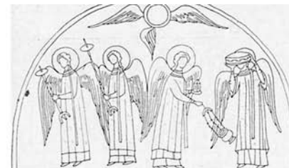
Fig. 16. Sts Constantine and Helen, Ohrid, Heavenly Liturgy