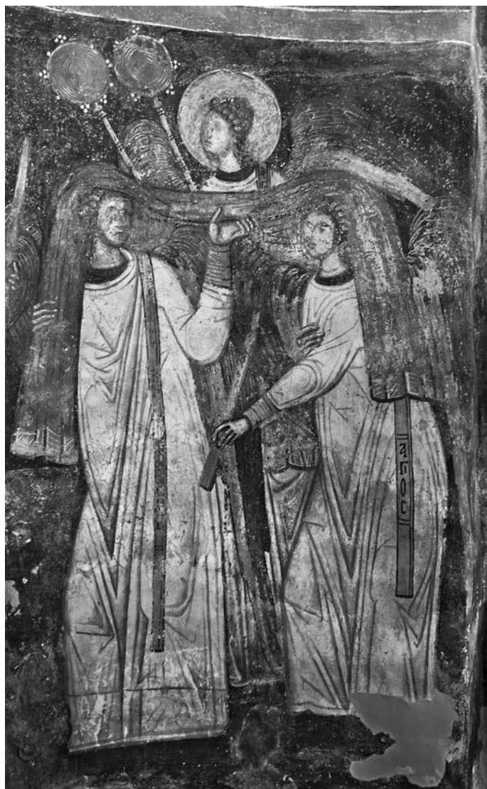
Fig. 11. Markov Manastir, angel-deacons with an aër

the aër, which frequently appear in the scenes showing the Melismos surrounded by officiating bishops and the Heavenly Liturgy, 87 clearly shows that the type of fabric