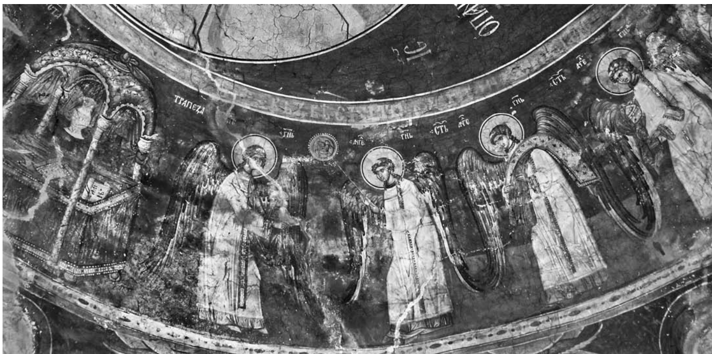
Fig. 13. The church of the Virgin Hodegetria, Patriarchat of Peć, Heavenly Liturgy, angel-deacon with an aër