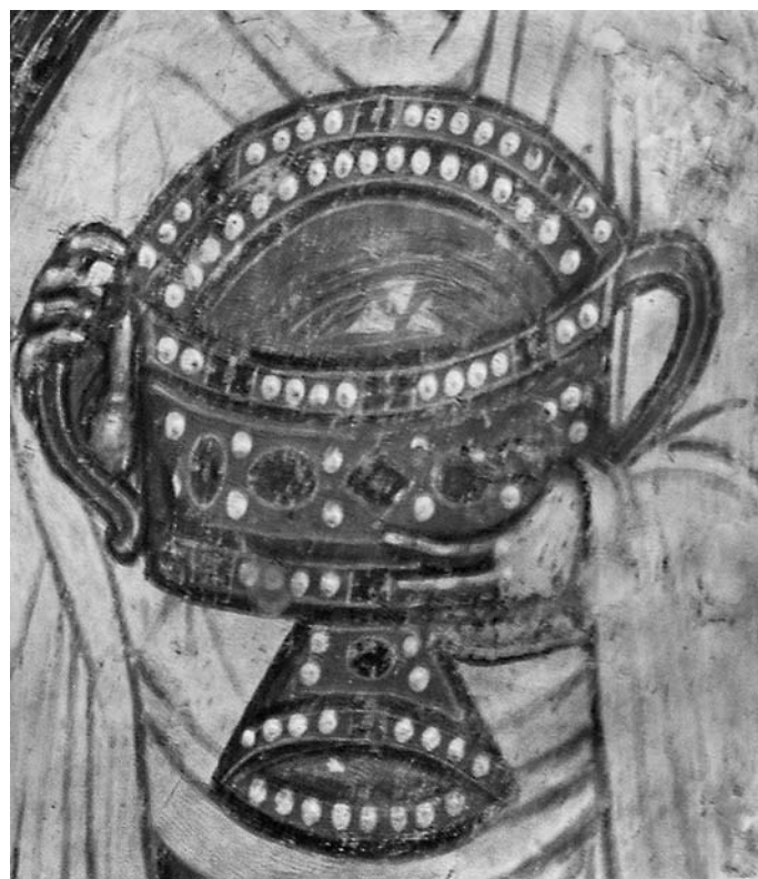
Fig. 18. Markov Manastir, angel-priest with chalice

Due to the need to adjust the iconographic pattern of the Heavenly liturgy to the space and the thematic framework of the lowest register in the sanctuary, the painters of Markov Manastir had to make certain departures from the model. These may be observed in the composition of the first group of heavenly concelebrants approaching Christ the Archpriest. The purpose of placing the angel-deacon with ripidia in the second plane was undoubtedly to emphasize the two figures holding a large aër above their heads. Bearing in mind that in the Late Byzantine period painting did not seek to illustrate ritual but to highlight its significance, we may assume that the intention behind depicting the large aër – which was regularly used in the pontifical liturgy since the fourteenth century, 113 in such a prominent place in the sanctuary apse was to duly emphasize its importance.