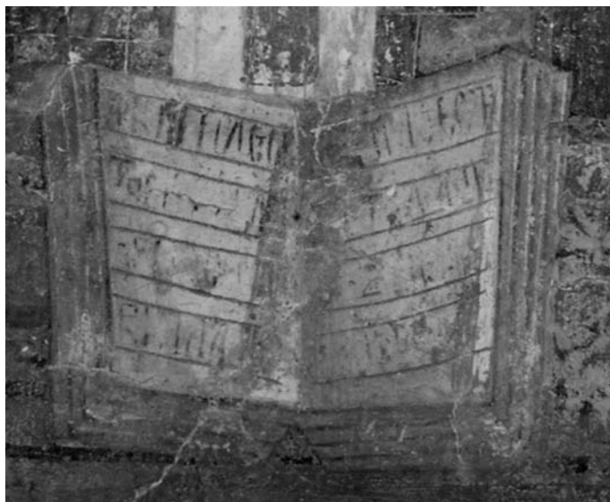
Fig. 5. Markov Manastir, apse, Christ the Great Archpriest, detail, leiturigikon