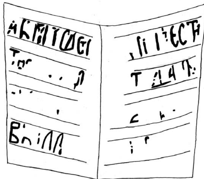
Fig. 6. Markov Manastir, inscription on the leiturigikon (drawing: M. Tomić Djurić)