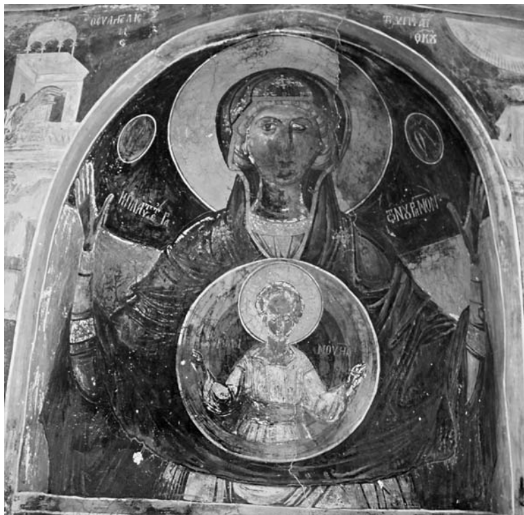
Fig. 9. St Nicholas at the monastery Zrze, The Virgin with Christ Emmanuel , (photo: T. Starodubcev)