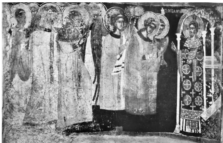
Fig. 3. St Phanourios at Valsamonero, The Great Entrance