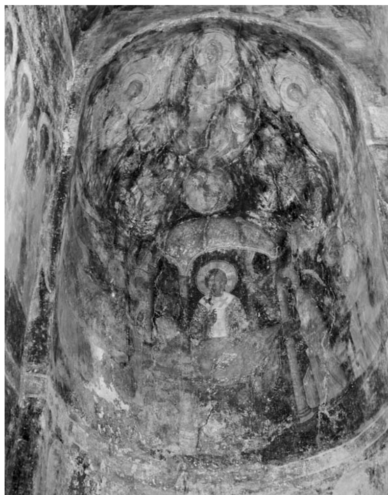
Fig. 2. Virgin Peribleptos, Mystras, Heavenly Liturgy

idea of Christ as the bishop “who offers and is offered” 10 is fully embodied in the sanctuary of the church of the Virgin in Modrište in Macedonia (1360–1380). Christ, as