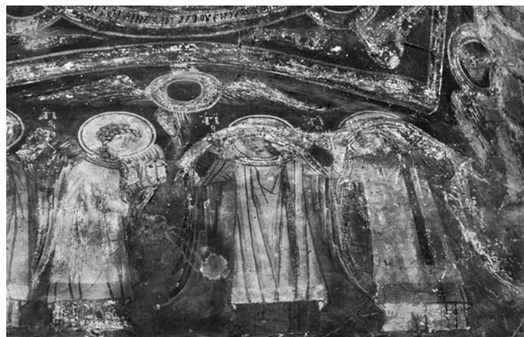
Fig. 15. Sts Constantine and Helen, Ohrid, angel-deacons with an aër

Helen, two angel-deacons are carrying an aër without figural decoration in the same way as those in Markov Manastir (figs. 15 and 16). 101 Nevertheless, unlike the example from Ohrid, which shows a proper way to carry an aër of large dimensions, in Markov Manastir we find an unclear detail. A part of the main celebrant's hand is depicted on the outer side of the aër . Such a position is not possible, having in mind that the fabric is shown falling over the shoulders and back of both angels.