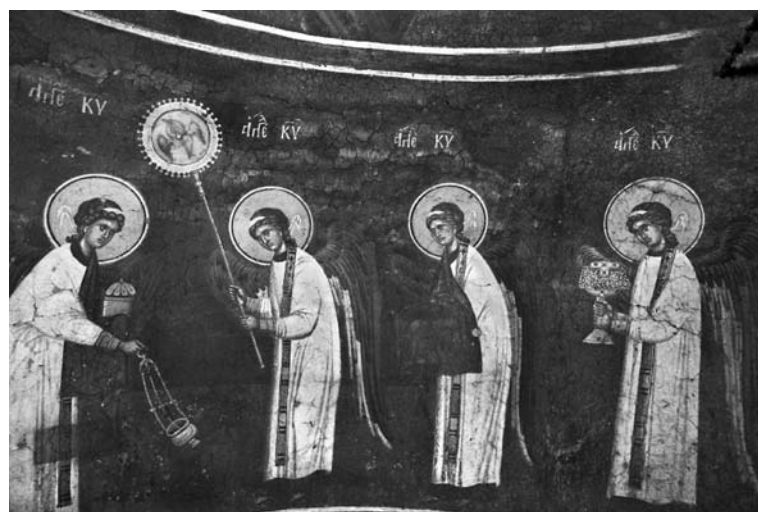
Fig. 12. Gračanica, Heavenly Liturgy, angel-deacon with an aër

depicted in those scenes is the same as that in our example. 88 Unlike the scene in Markov Manastir, in other examples of the ceremonial aër, the symbolism of passion inherent in the Great Entrance is emphasized by the dead body of Christ. 89 However, though the development of figural decoration on aërs can be traced back to the late thirteenth century, purely ornamental decoration or a plain-coloured background with a cross in the centre persisted until the end of the fifteenth century. 90 This is also confirmed by the pictorial practice. The large aër with the representation of Christ's dead body became a mandatory element of the iconography of the Heavenly Liturgy of the sixteenth century. 91