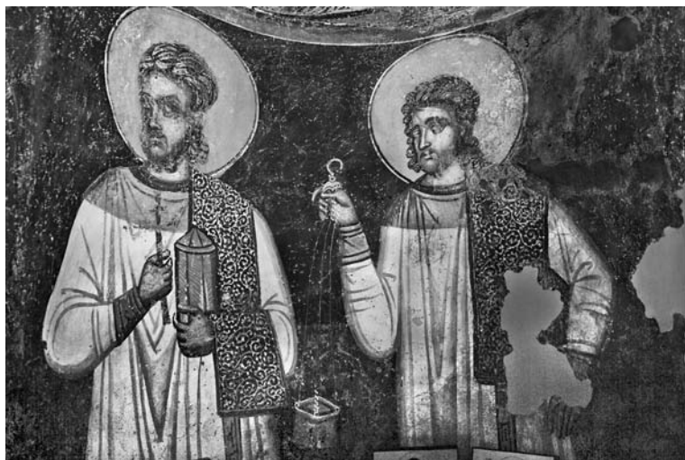
Fig. 17. Markov Manastir, diaconicon, holy deacons – most probably St Lawrence and St Romanos the Melodist

censer) held in their hands, both holy deacons have an aër on their left shoulder. 105 It is depicted as a narrow piece of red textile with gold-embroidered floral ornaments rendered in the fresco technique, just like in the aër shown on the shoulder of St Stephen the Archdeacon.