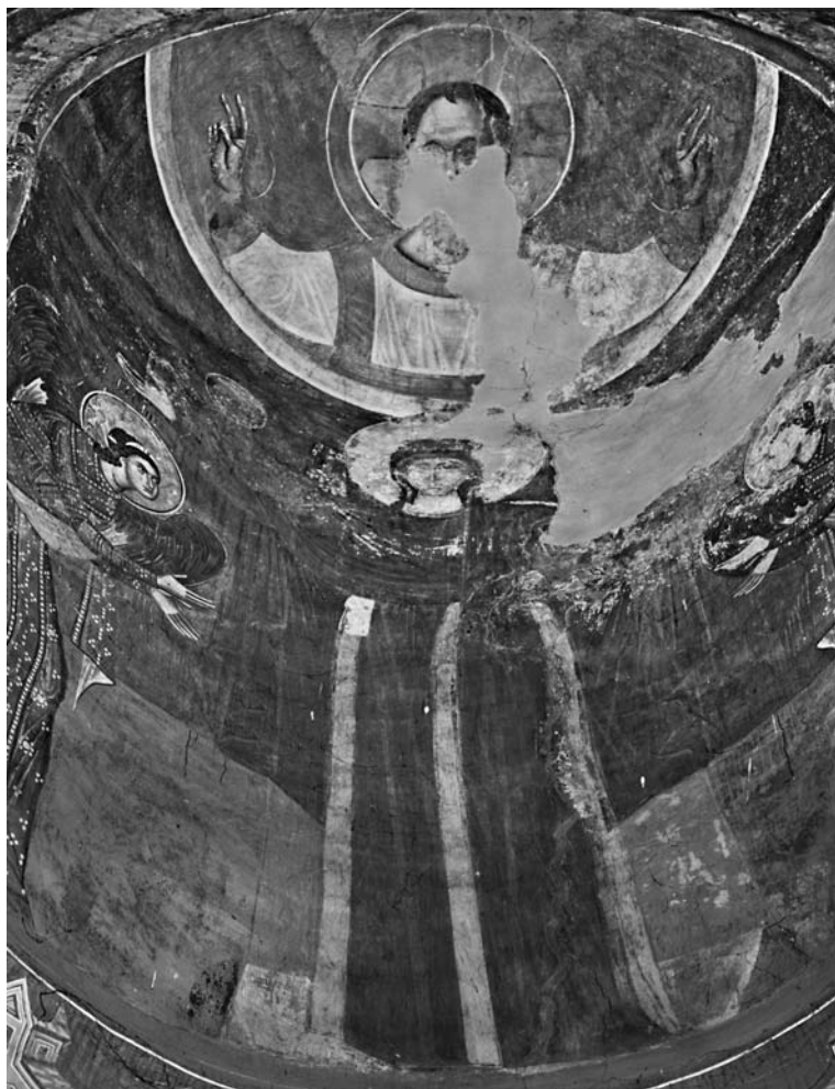
Fig. 7. Markov Manastir, The Virgin and Christ Emmanuel

the Cherubic Hymn. The theological idea of a bishop as an 'icon' of Christ would become visually highlighted during the Great Entrance, when the celebrant, with a chalice in his hands, stood in front of the Royal Doors facing the believers. The religious feelings of the congregation were anticipated and intensified by making the central section of the painted decoration of the sanctuary's first register partially visible only in selected moments during the Holy Eucharist. By unifying the Heavenly and Earthly Great Entrance in Markov Manastir, the eschatological dimension of the Holy Eucharist, which is performed simultaneously in the historical moment and the eternal Kingdom of God, is visually highlighted. 38 Still, one should also remember that, though liturgical rubrics prescribe the closing of the Royal Doors after the Great Entrance, the text inscribed on the painted leitourgikon corresponds to the opening dialogue of the anaphora, which consists of the celebrant's greetings and the responses of the laity. Hence, though the celebrant was visually inaccessible to believers, the connection between them was achieved through the laity's vocal participation in the liturgy. By establishing a spatial and visual barrier, the altar screen augments the effect of liturgical text during the Eucharistic rite. 39