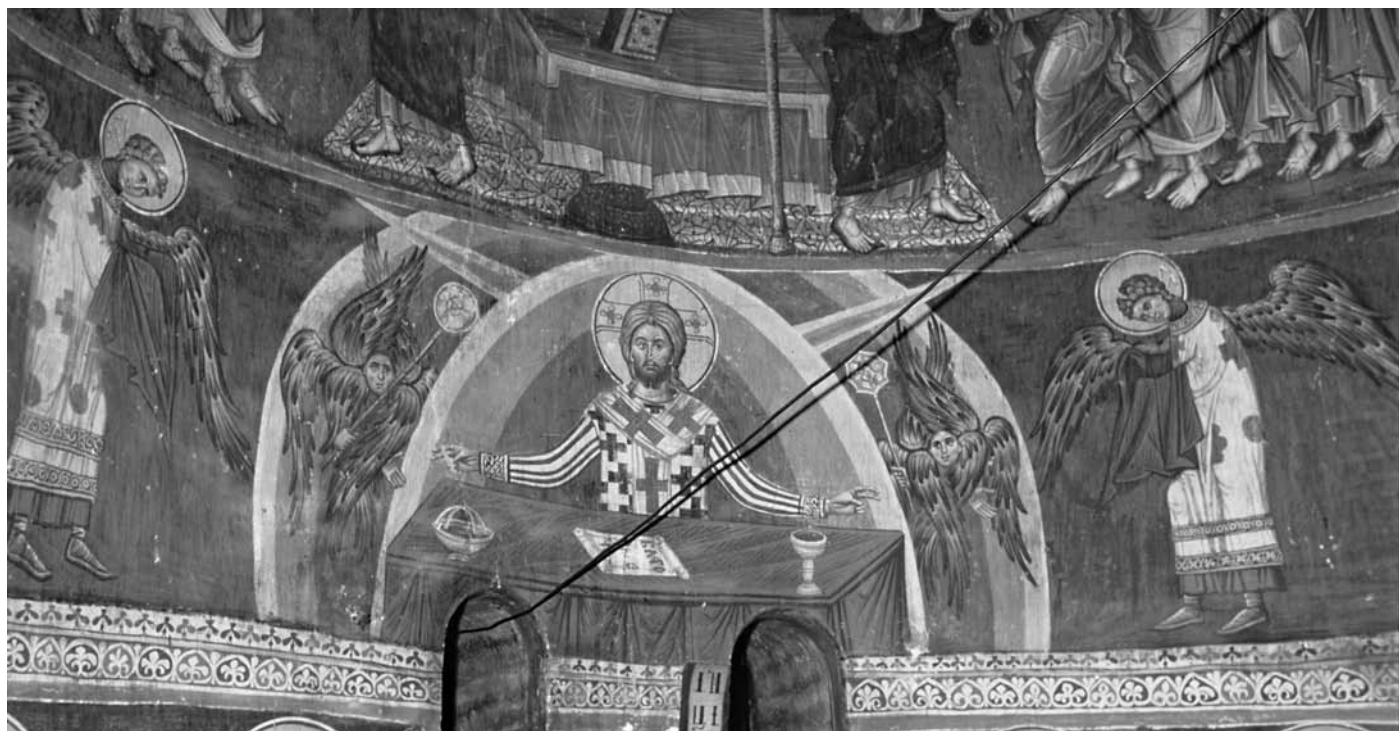
Fig. 1. Lesnovo, Christ the Great Archpriest, (photo: I. M. Djordjević)

Christ the Great Archpriest would also become part of the scenes of the Heavenly Liturgy depicted in the sanctuaries of two churches in Mistra: the prothesis of the Virgin Peribleptos (1350–1380; fig. 2) and the southeast chapel of St Sophia (1350 and 1365). 8 At the same time, these were the earliest examples of the Heavenly Liturgy which include the image of Christ as the Great Archpriest. 9 The liturgical