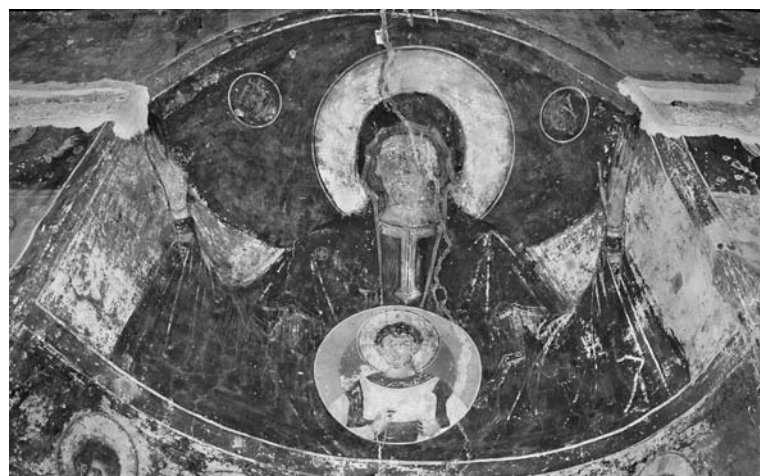
Fig. 8. Bogorodica Bolnička, Ohrid, The Virgin with Christ Emmanuel , (photo: I. M. Djordjević)

According to the common iconographic practice, Christ Emmanuel in the sanctuary was to be depicted dressed in a chiton and a himation, with a clavus on the right shoulder, no matter whether the Infant God was shown as a bust or was accompanied by the Virgin. The iconographic tradition of the seat of the Ohrid Arch-