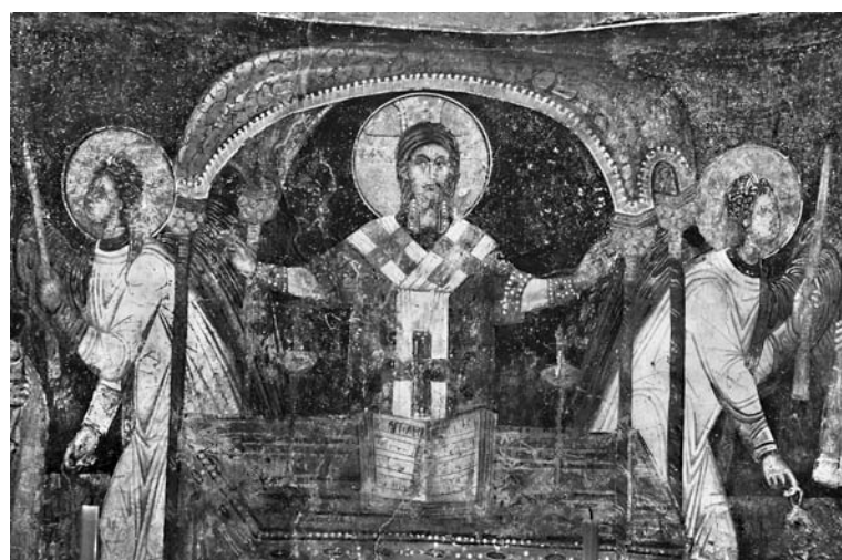
Fig. 4. Markov Manastir, apse, Christ the Great Archpriest

the ideal priest dressed in a festive sakkos , is depicted in the second register in the sanctuary as serving the Holy Liturgy over Christ the sacrificial Lamb, while the most prominent bishops of the Church are con-celebrating. 11 A very interesting example of this theme was painted in the late fourteenth century in the church of St Stephen at Soletto (Salento, Apulia), where the sanctuary apse features an image of Σοφία ο λόγος του Θεού blessing the Holy Gifts. 12 In the iconographic programme of this south Italian church, the symbolic representation of the Divine Wisdom as Christ the Pre-Eternal Logos, which was at that time typical of the Balkans, was endowed with an explicitly Eucharistic meaning. 13 The clerical character of Christ Emmanuel is indicated by the motif of epitrachelion , decorated and crossed on the chest according to the Latin tradition. 14 Although it is symbolic in character, the image of Christ serving the liturgy in front of the Old Testament tabernacle in the sanctuary of the church of the Transfiguration in the monastery of Zarzma in Georgia (mid-fourteenth century), clearly shows the fourteenth-century iconographic tendency to highlight those elements of the image of Christ which identify Him as a bishop. 15