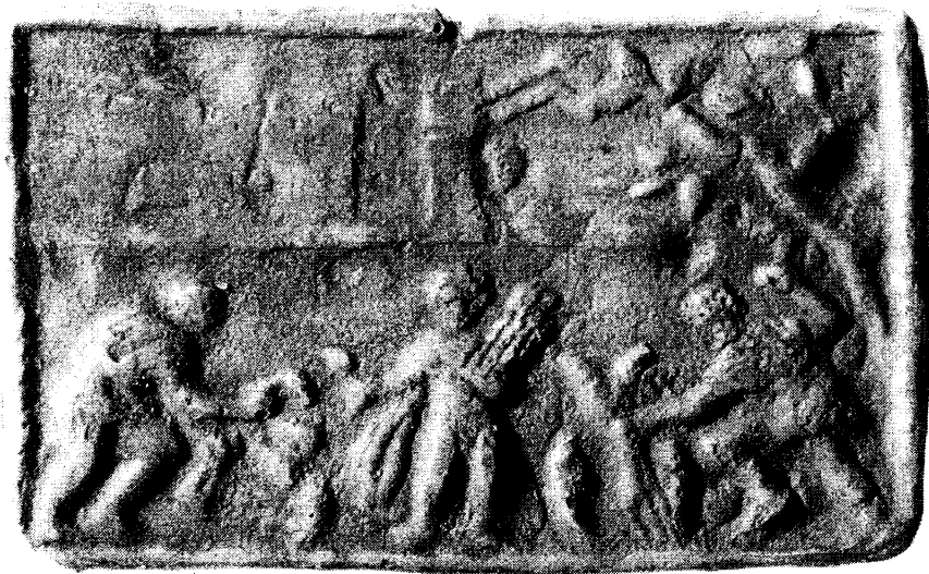
Fig. 1 Bronze tile from the vicinity of Sirmium

of the illustration in the lower zone, does not coincide with the fortified entrance into the city, which is the pillar of the second zone. The displacing and breaking of a main axis in a picture is characteristic for the latter part of the 3rd century. The hair-style and general appearance of the reapers cannot be of use in determining the chronology of the item, due to the murkiness of the picture. The central figure has a wreath on his head; the two others have short hair, and unaccented chins, characteristic for portraits of new dynamic impressionism from the time of military emperors. 14