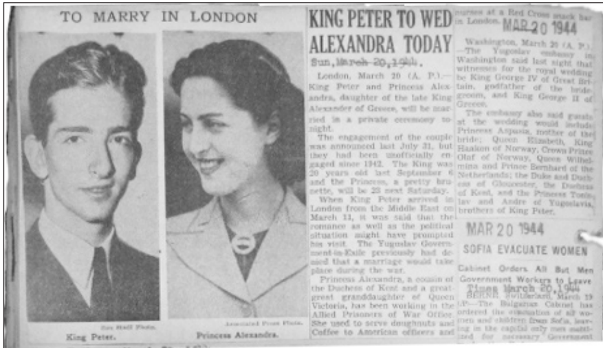
Fig. 7 The story of the royal wedding was somewhat of an obsession for the American press

During the war, this new type of women, which the Partisans promoted, fitted well with the image of the new woman emerging during the New Deal period. Women were no longer members of the family, where the male was the head, but breadwinners themselves. They joined the workforce, first during the Great Depression, when the man was not able to provide enough, and then during the war, to help the war effort. Therefore, a stark contrast was drawn between the domestic upper-class women, who supported the Chetniks with their fundraising, and the determined and beautiful ordinary women, who joined the Partisans. In short, Vladimir Velebit and Louis Adamic hit the jackpot with the image of Partisan women in the American press. They presented that image at the right time for their cause, because the image of a free warrior woman would be eclipsed in American culture by the post-war image which saw “Rosie the Riveter” leaving the workforce and returning to the role of demure and domesticated householder.