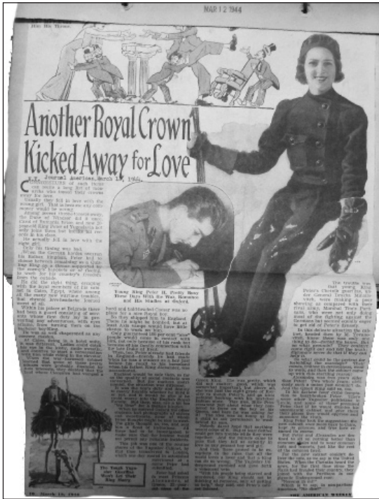
Fig. 8 "Another Royal Crown Kicked Away for Love", American Press , March 12, 1944.

a king to marry, but the timing was bad. Fierce male resistance warriors in Yugoslavia, following their non-romantic code of ethics believed that it was not appropriate for a king to marry while the liberation struggle was still going on. According