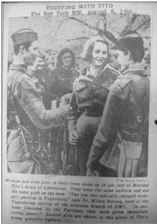
Fig. 2 Tantalizing picture of Tito's female partisans in the New York Sun of August 8, 1944

The liberation of Yugoslavia, however, did not come as a result of the Allied landing in the Adriatic, but as a result of the push by the Red Army through Serbia. Once installed in Belgrade with the help of the Red Army, Tito changed his attitudes, and became much more aggressive toward the Western Allies, even threatening the Allied positions in northern Italy