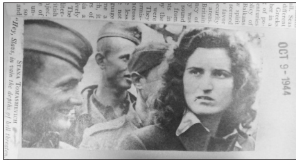
Fig. 6 Stana Tomašević, Tito’s Partisans’ top “photo model”

Gender was defined very differently in the public relations of the Partisan movement. Stana Tomašević was a famous Partisan fighter and also a model, whose photographs appeared on the pages of many American newspapers. 22 According to the British liaison to Tito’s Partisans, Fitzroy Maclean, the photographs of Tomašević contributed considerably to the positive opinion about Yugoslav Partisans. Stana Tomašević was not the only Partisan woman that was photographed, there were others, such as Mira Afrić, but their number was limited, and a few of the carefully staged photographs were widely circulated. 23 The impression that was conveyed to the public was that fighting women accounted for as much as a quarter of Tito’s armies. In many of her pictures Stana Tomašević was photographed professionally and with extensive preparation by the war photographer John Talbot. The fact that there were many women in Tito’s army was repeatedly emphasized in the press. Those women were not just helping and supporting the men, they were fighting. They left the kitchen for the front and there was no domestic life for them until the victory was won. We would say today, they also fought hard. In fact, Mihailović was often criticized among the Partisans for leaving his wife at home. Throughout the war, the