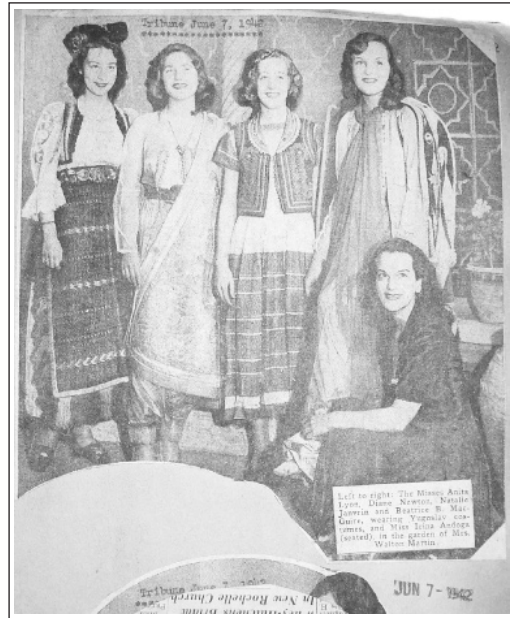
Fig. 4 Fundraising in Yugoslav folk costumes

of the greatest stylists of the English language and published regularly in the New York Herald Tribune , New Republic , and in many newspapers in her native London. Rebecca West's popular travelogue, even today one of the 100 most read books of the century, contributed greatly to the Balkan Myth, the image of the Balkans as a place of death, martyrdom, sacrifice. Though employing such imagery in describing resistance to the Nazis, West personally believed the Allies should "fight for life, not for martyrdom," and thus sought to present the Chetniks as fighters who rejected