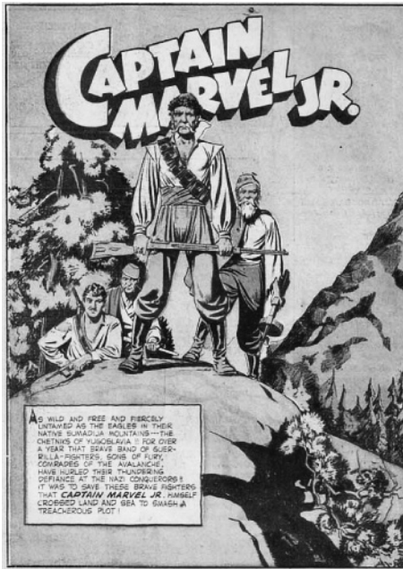
Fig. 3 Captain Marvel featuring the Chetniks. DC Comics: Master Comics, no. 36 (Feb. 1943)

The Cost of Our Yugoslav Blunder” were still very common. 19