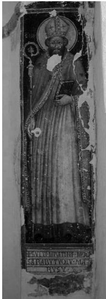
Right: St Martin of Tours, Church of St Anne, Kotor