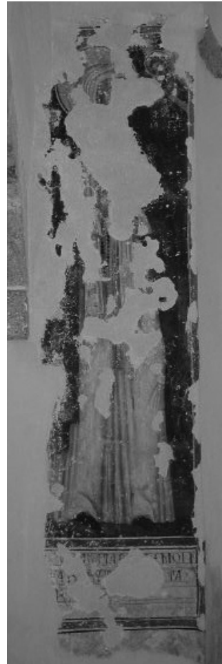
Far right: St Catherine of Siena, Church of St Anne, Kotor