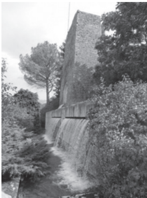
Figure 2. Overflow at the Peschiera spring (Velino Basin), tapped to supply the city of Rome

Many other cities and tourist centres along the Adriatic, Ionian and Aegean coasts are also consumers of karstic groundwater (Stevanović & Filipović, 1994; Milanović, 2005; Radulović, 2000; Stevanović & Eftimi, 2010; Fiorillo & Guadagno, 2012; Kallioras & Marinou, 2015). The cities of Southern Italy – Naples, Bari and many others – utilise large springs such as Caposele ( Q_{av.} = 4 \text{ m}^3/\text{s} ), Serino ( Q_{av.} = 2.2 \text{ m}^3/\text{s} ); the largest spring on the northern Italian coast, Timavo, with an average discharge rate of 30 \text{ m}^3/\text{s} , supplies water to Trieste; Rižana near Koper ( Q_{av.} = 4.3 \text{ m}^3/\text{s} ) is the main source for supplying water to Slovenia's coastal zone; the Žvir group of springs ( 0.6\text{--}3.0 \text{ m}^3/\text{s} ) supplies water to Rijeka, the largest Croatian port; while Jadro Spring ( 3\text{--}50 \text{ m}^3/\text{s} ) is the main source for the water supply of Split. Ombra Spring is the largest permanent karstic spring in the Southern Adriatic ( Q_{min} = 2.3 \text{ m}^3/\text{s} ), supplying water to the city of Dubrovnik.