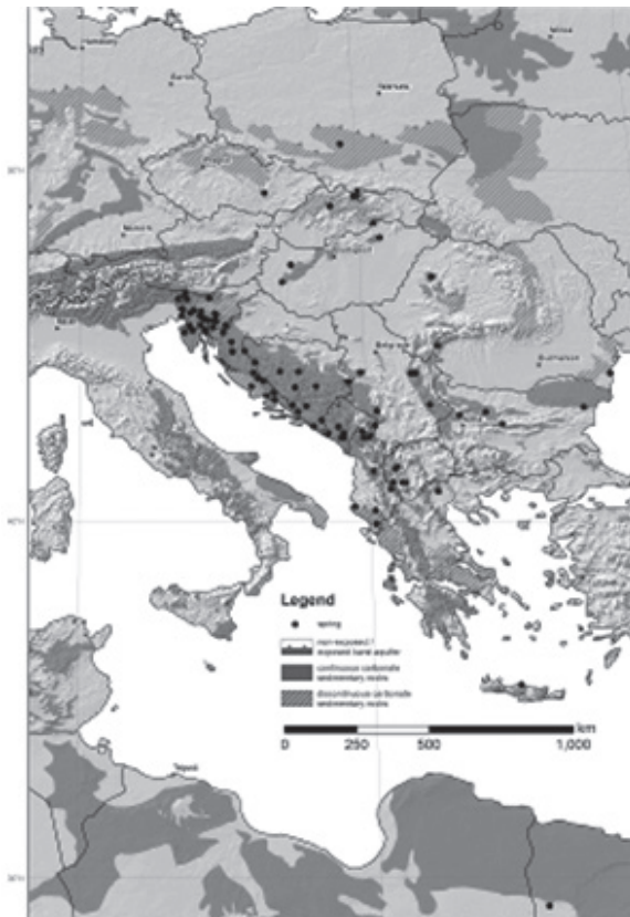
Figure 6. Dense distribution of karstic springs in the Dinaric part of the SE Europe on one of draft WOKAM maps (from Stevanović et al., 2016)

Within the DIKTAS project (Dinaric Karst Transboundary Aquifer System), the evaluation of water budget and actual water use comprise eight main transboundary karst aquifers (TBA): Una (Fig. 7), Krka, Cetina, Neretva, Trebišnjica (all shared by Croatia and Bosnia and Herzegovina), Bilećko Lake, Piva (B&H and Montenegro) and Cijevna/Cemi (Montenegro and Albania). The analysis indicates that water extraction is still far below the aquifer's replenishment potential, and there is no evidence of significant over-exploitation in the studied TBAs (Stevanović et al., 2016). For instance, in the case of Cetina and Neretva TBAs, the average extraction of groundwater is ten times lower than the total minimal discharge of the local springs (dynamic reserves). However, shortage of water is evident locally during summer and early autumn months, coinciding with increased demands caused by the tourist season.