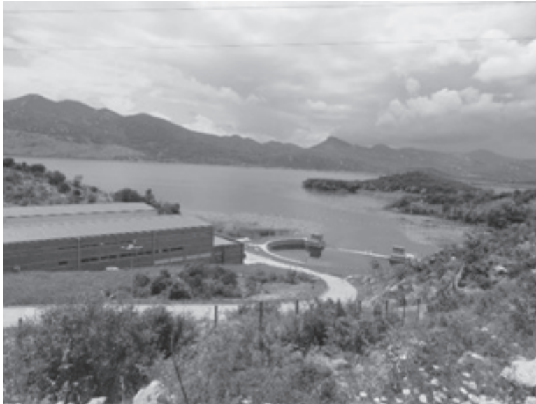
Figure 3. Bolje sestre source at the Skadar Lake shoreline, which now supplies the entire Montenegrin Coast