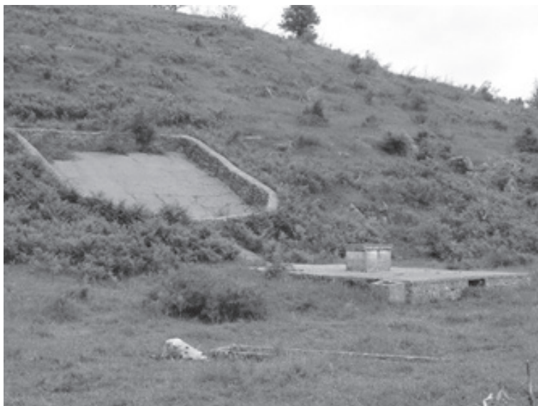
Figure 4. A typical cistern – reservoir for rainwater in the high mountain of Vojnik, between Nikšić and Šavnik (Montenegro) Слика 4. Типична цистерна – резервоар кишнице на планини Војник, између Никшића и Шавника (Црна Гора)

groundwater table is often very deep, with no available surface waters. The only way to provide water to the local villagers and their livestock is to build cisterns and specific intakes for collecting rainwater (Fig. 4).