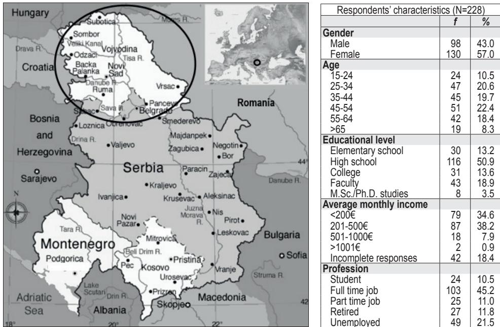
Figure 1: Analyzed study area and socio-demographic characteristics of respondents

indicator of the measurement scale acceptance. The sample in this research ( N \geq 51 ) is adequate for meaningful statistical assessments (Bagozzi, 1981).