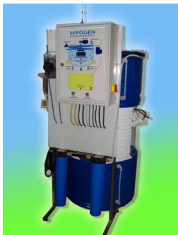
Figure 2. Picture of the modular charge electrochemical generator for automatic production and dosing disinfectants and with self cleaning electrodes

Among the capacities given in this brochure, we can produce our system which can satisfy much higher needs for equivalent chlorine, up to 10 kg per day. Such system comprises all other elements except the reactor tank and hypochlorite storage tank, which are to big and must be placed separately.