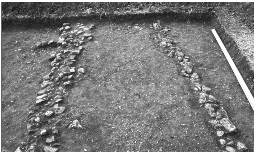
Fig. 2 Trench 3: Possible SW-NE intra-settlement communication in Timacum Maius (?)

Roman road, excavation in that zone was cancelled in order to be resumed in a more broadly designed campaign which would establish its exact position in relation to the settlement and its possible importance in the process of urbanization.