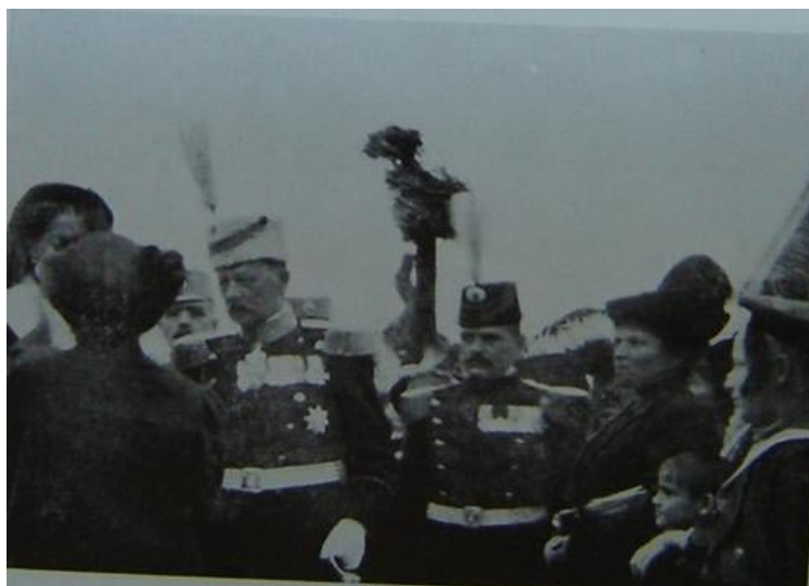
General Popović and Lady Paget at Railway Station of Skoplje 1915.