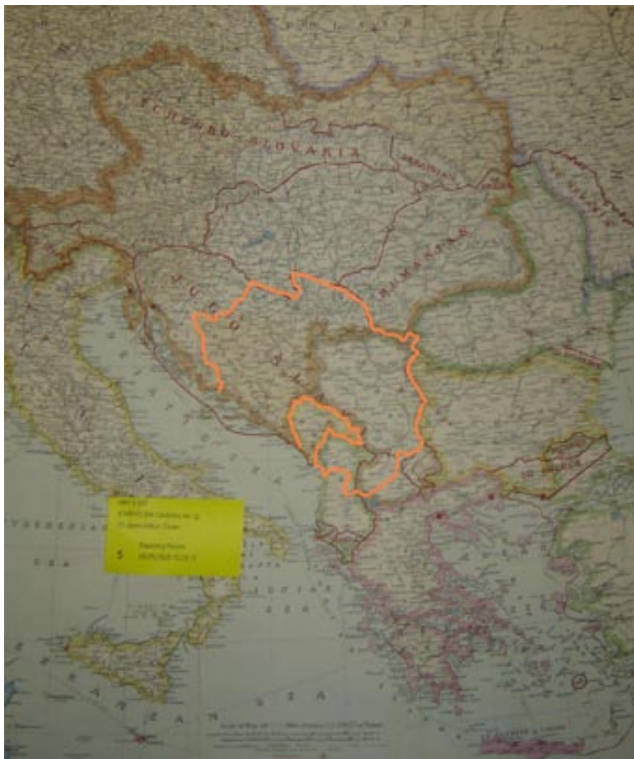
Plans for the dissolution of the Austria-Hungary (1917), PRO, MPI 1/397