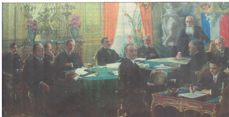
Government of the Kingdom of SCS, presided by Nikola Pašić

The Jugo-Slav desire that the boundaries of their prospective Confederation shall be determined on ethnological lines, and upon this basis they lay claim to extensive territories. This would include, in addition to Serbia, Montenegro, Croatia, Slavonia, Bosnia, Herzegovina, and Dalmatia, portions of Carinthia and Styria, the whole of Gorizia, Carniola, Istria, and the coast, together with islands down to the Albanian frontier. The northern frontier of their State would run approximately from Graz in a south-easterly direction along the Drave, then north of the provinces of Baranja,