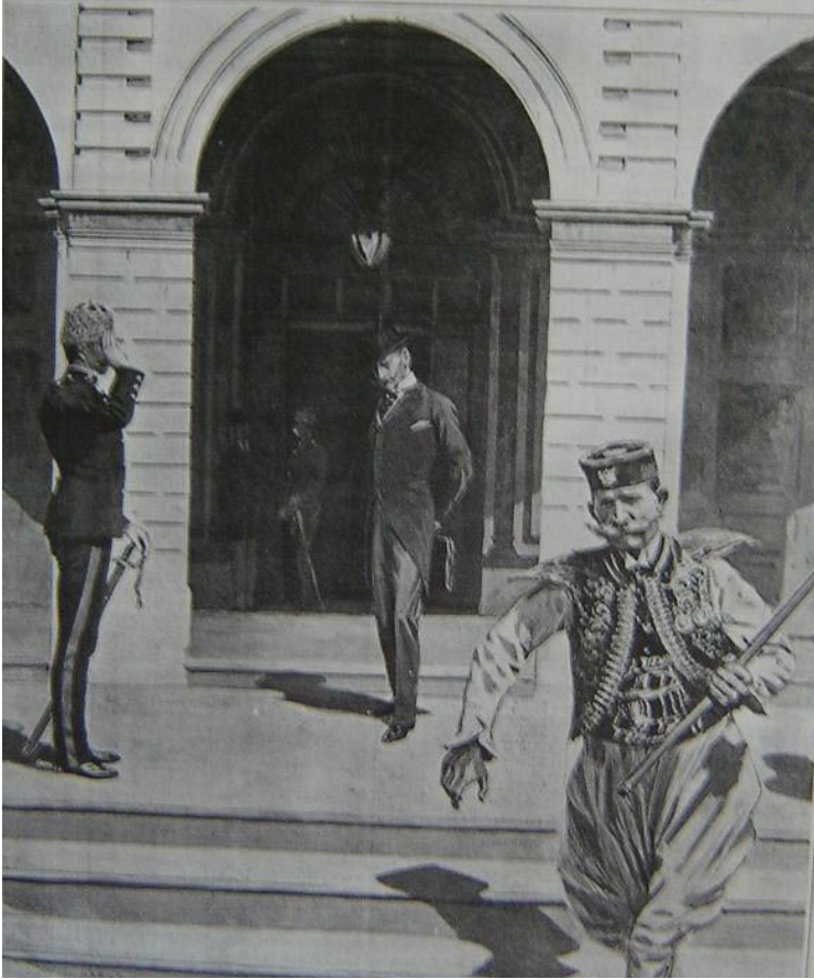
Montenegro Breaking Relations with the Ottoman Empire, the Montenegrian Minister Waiting on the Step of the Sublime Porte for the Carriage After Having Demanded his Passport, The Illustrated London News , 12 October 1912.