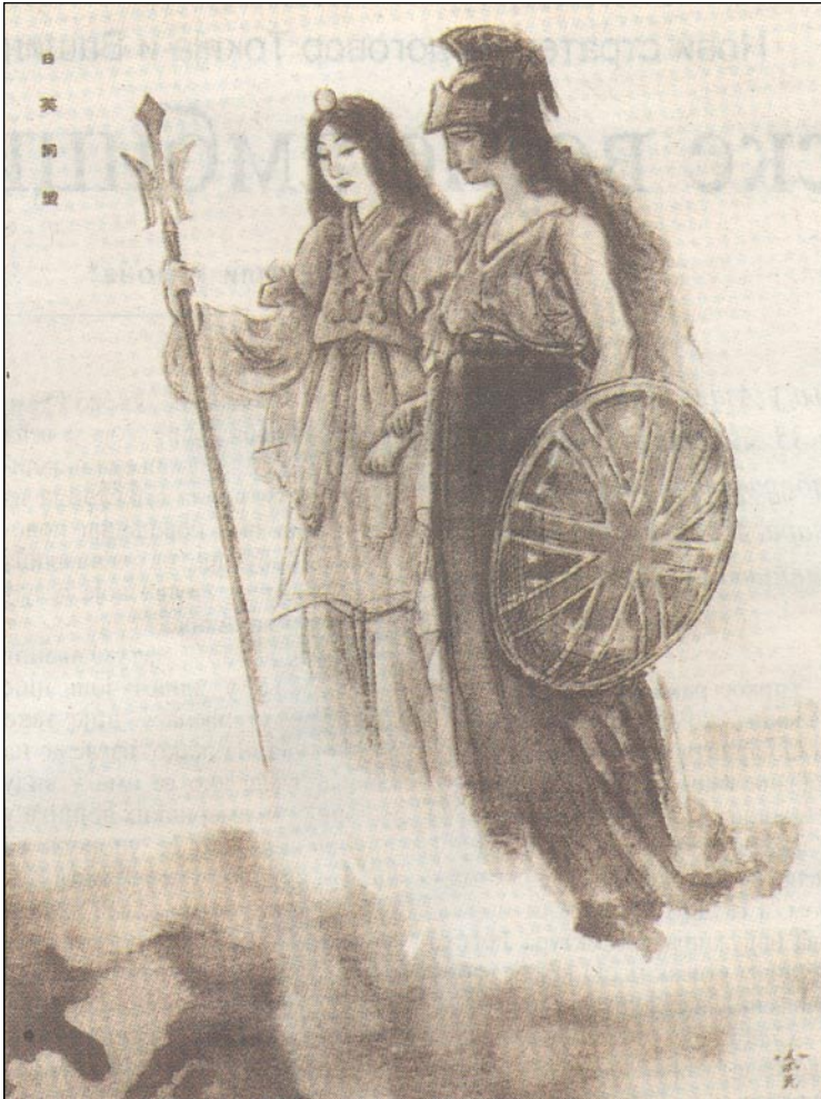
Ango-Japanese Alliance, contemporary caricature