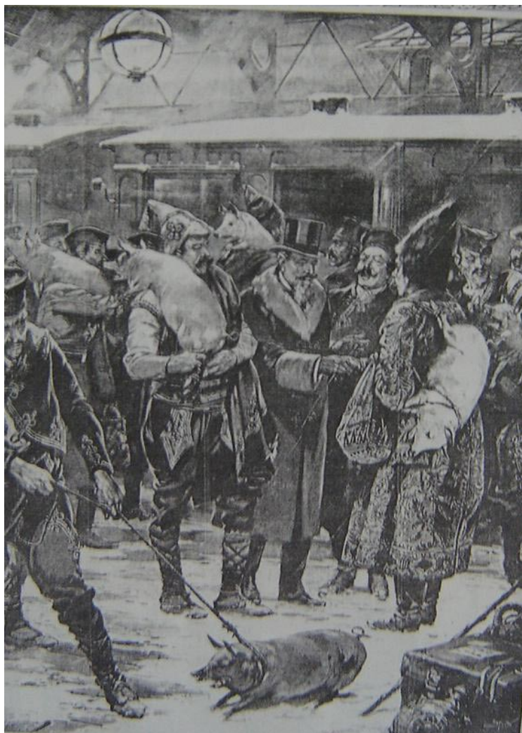
Pig and Politics: Servian MP's Taking Home Living Pigs for the Christmas Dinner, The Illustrated London News , 26 December 1908.