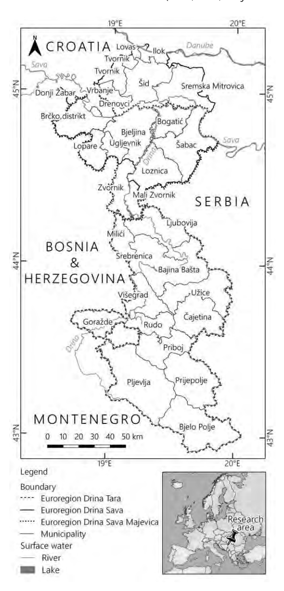
Figure 1. The map of the researched Euroregions and the municipalities belonging to them.

The development of tourism in Podrinje is a subject and a challenge of cross-border and Euroregional cooperation within the formed Euroregions Drina–Sava–Majevica (DSM), Drina–Sava (DS), and Drina–Tara (DT) (Figure 1). The established Euroregions include the rural area along the Drina River, which is not fully developed. It is characterized by preserved natural resources which, on the principles of the concept of sustainable development and integral protection, condition the selective economic activation of tourist resources near the border line (Lečić, 2011; Stojkov & Đorđević, 2004; Šimičević, 2007). Internationally