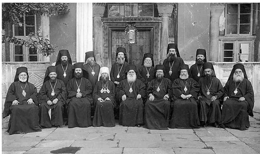
Bishop Nikolaj at the inter-Orthodox preparatory committee in 1930 at the monastery of Vatopedi on Mount Athos