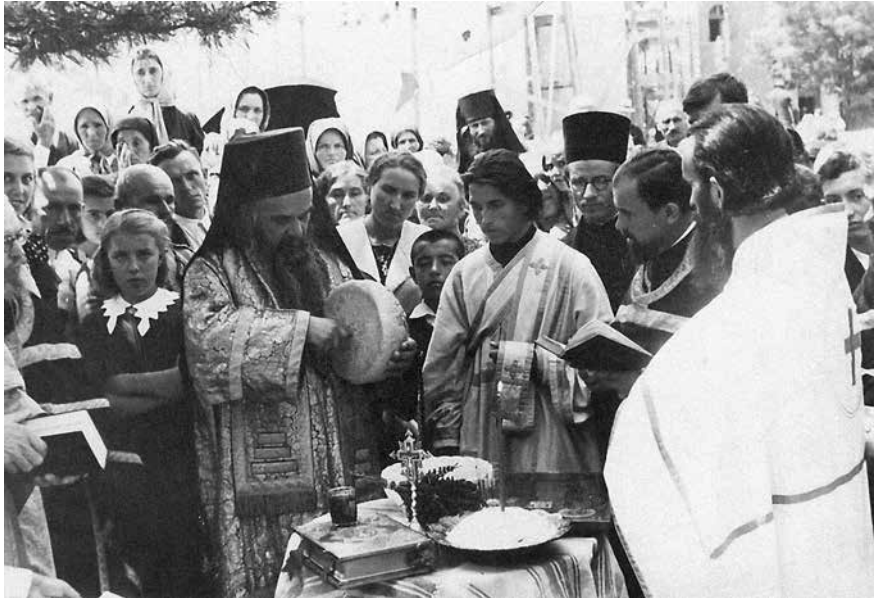
Bishop Nikolaj Velimirović cuts the feast bread— slavski kolač [probably in Kraljevo in 1936]

of the debate that Nikolaj had with the Catholic Archbishop of Zagreb, Antun Bauer, who denied the importance and role of Saint Sava in the joint Yugoslav project. 72