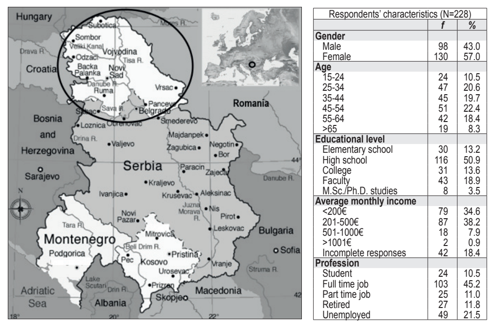
Figure 1: Analyzed study area and socio-demographic characteristics of respondents

indicator of the measurement scale acceptance. The sample in this research (N \geq 51) is adequate for meaningful statistical assessments (Bagozzi, 1981).